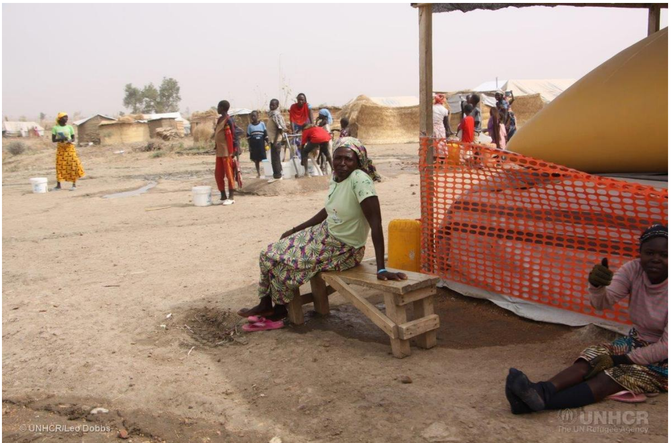
Cameroon/Nigerian refugee woman rests beside water bladder in Minawao camp ©UNHCR/Leo Dobbs/December 2015