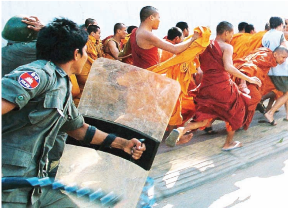
Cambodian riot police chased and beat Khmer Krom Buddhist monks after they tried to deliver a petition to the Vietnamese Embassy in Phnom Penh calling for greater religious freedom for Khmer Krom in Vietnam.