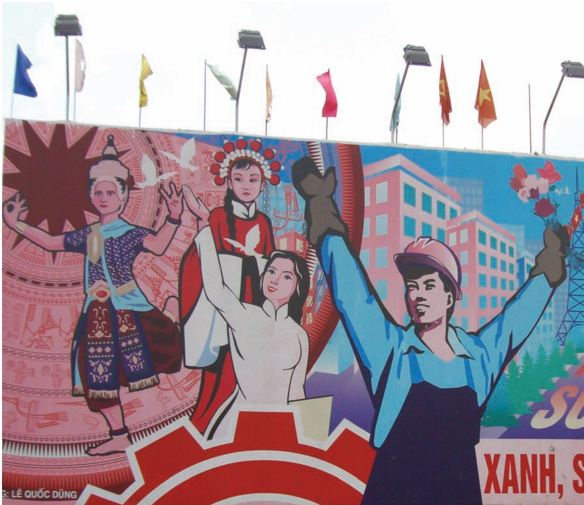
A government propaganda billboard in Soc Trang provincial town exhorts Vietnam's different ethnic minority groups, including a Khmer woman at the far left, to work together to build a beautiful, clean and "civilized" city.