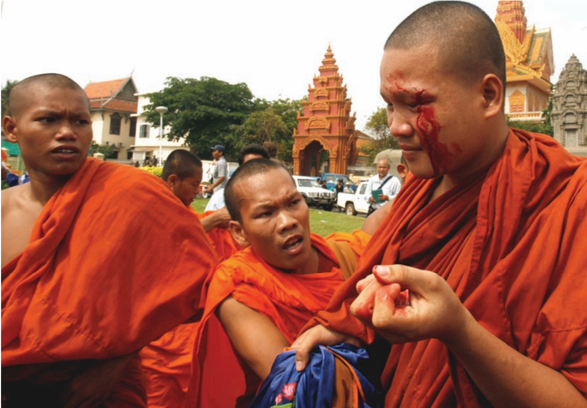
Counter-demonstrators physically attacked Khmer Krom protesters on April 20, 2007 in front of Phnom Penh's Ounalom Pagoda.

On April 20, 2007, police forcefully dispersed another demonstration by around 50 Khmer Krom monks at the Vietnamese and US embassies in Phnom Penh. 187 Later that night one of the monks who had joined in the march was badly beaten by a group of unknown men after returning to his pagoda. 188