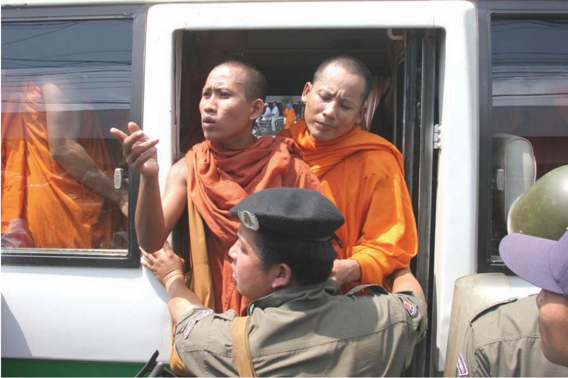
Phnom Penh authorities ordered police to load protesting monks onto busses during a demonstration in Phnom Penh on February 27, 2007, for defrocking and deportation to Vietnam.

After intervention by monitors from several Cambodian human rights organizations and the Office of the High Commissioner for Human Rights in Cambodia, the monks were allowed to leave the bus. Rights groups transported most of the monks to Samaki Reangsay Pagoda, whose abbot heads the Khmer Krom Krom Buddhist Monk Association in Cambodia and has long provided shelter to Khmer Krom monks and laypeople from the Mekong Delta region of Vietnam. 183