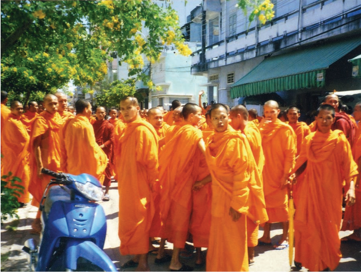
Buddhist monks on their way to Soc Trang town, where they conducted a peaceful protest in February 2007.

The authorities then sent the defrocked monks to their home villages, where they were placed under house arrest or police detention, without issuing arrest warrants or specifying the charges against them. During interrogations, police beat some of the monks. On May 10, 2007, five monks were sentenced to prison terms of two to four years by the Soc Trang Provincial Court. Another 25 monks were expelled from the Pali School and sent to their home pagodas, where they were placed under surveillance.