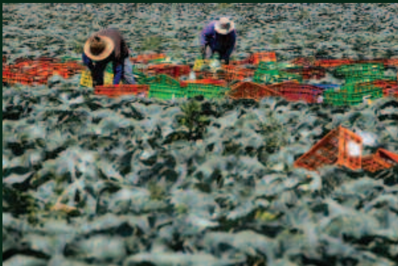
Thai agricultural workers working in a cabbage field on a farm in southern Israel, on July 16, 2014.

A Raw Deal —based on interviews with 173 Thai migrant workers, farmers' representatives, NGOs, and intergovernmental agencies details conditions facing Thai migrant workers in Israel and recommends specific steps authorities should take to improve those conditions. Its central recommendations are that the Israeli authorities should streamline labor inspection processes and launch an immediate investigation into deaths in the agricultural sector.