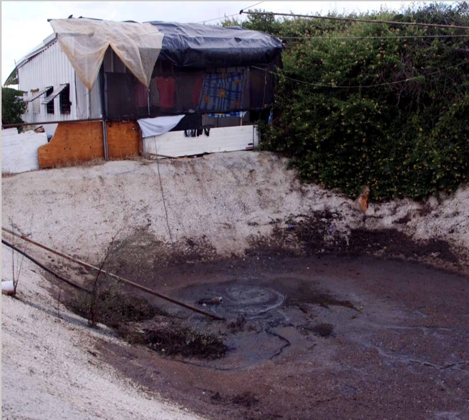
This home for agricultural workers at a vegetable farm in central Israel, was used as a storage facility for chemicals before the farmer converted it into accommodations for workers.