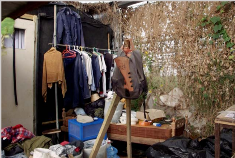
Living accommodation for Thai agricultural workers at a vegetable farm in central Israel, November 1, 2014. Workers at this farm live under a greenhouse, which can reach temperatures of 50 degrees Celsius (122 degrees Fahrenheit) or more during the summer months.