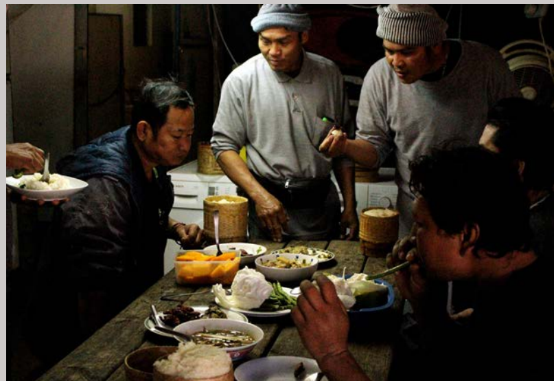
(top) A Thai agricultural worker shows a photo of his daughters who are in Thailand, at a farm in central Israel, October 31, 2014. Workers often don't see their families for the 63 months that they are permitted to work in Israel.