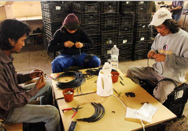
(top) A Thai agricultural worker at a farm in southern Israel says his hands break out in a rash after handling chemicals without sufficient protection. He says the gloves he uses he purchased himself, and the previous ones were sent by his family in Thailand after the farmer didn't provide them.