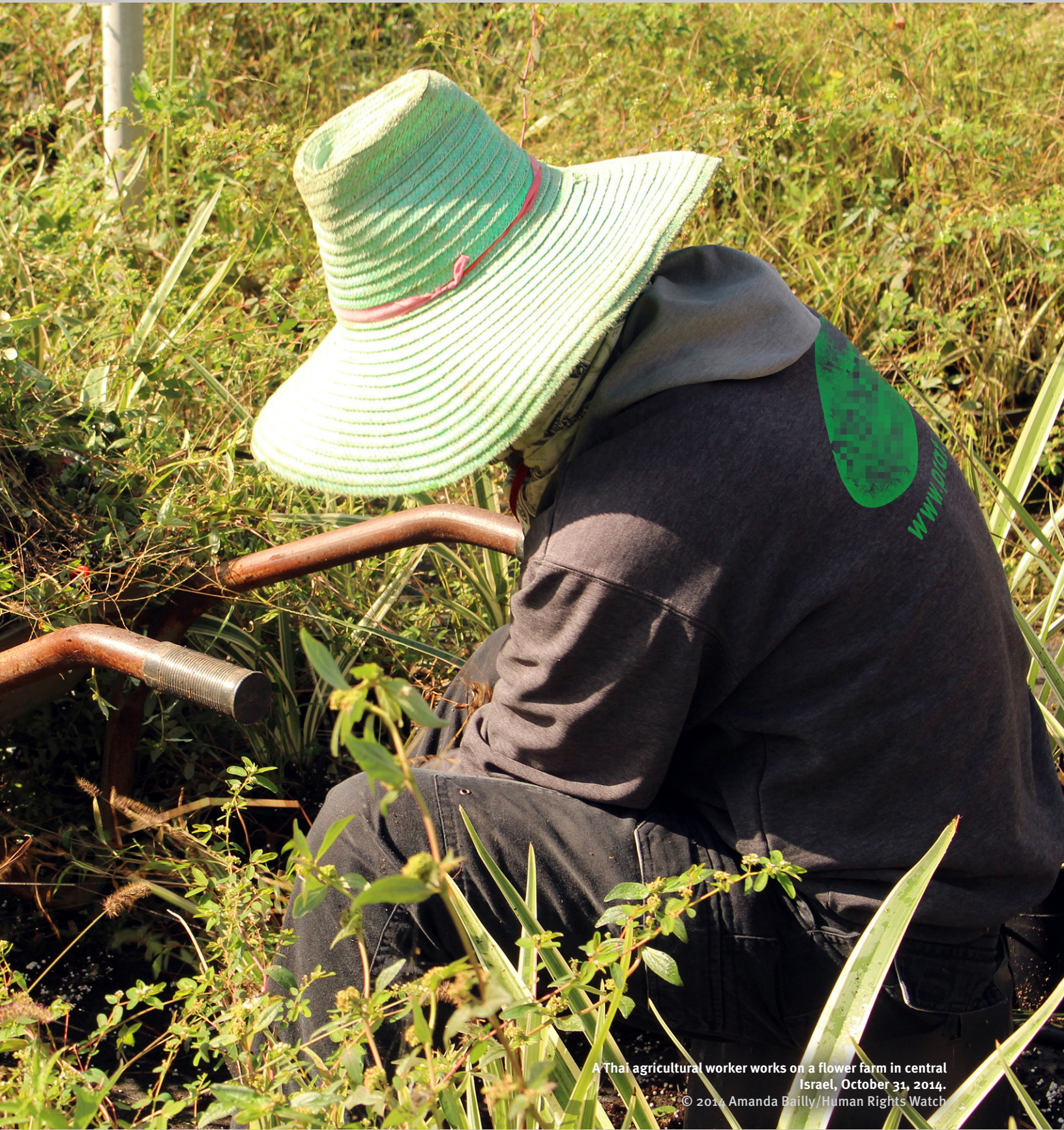
A Thai agricultural worker works on a flower farm in central Israel, October 31, 2014.