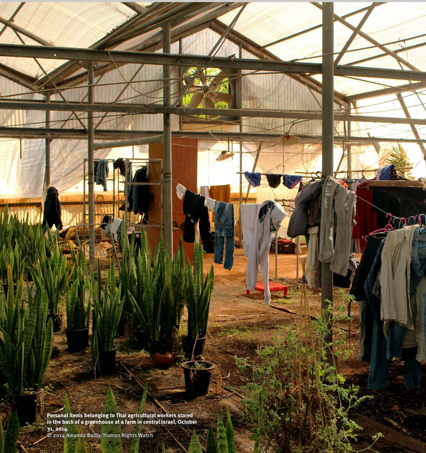
Personal items belonging to Thai agricultural workers stored in the back of a greenhouse at a farm in central Israel, October 31, 2014.