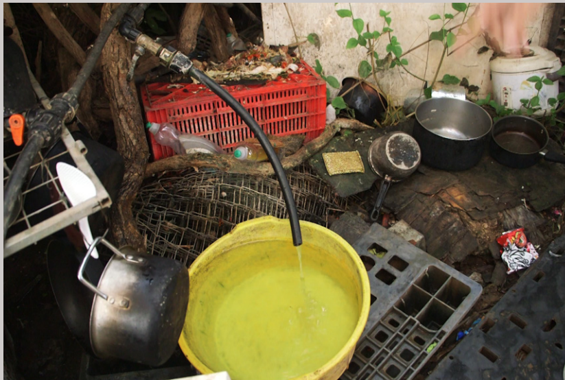
The water source for workers living in a building that formerly was used as a chemical storage facility, according to a former worker. Central Israel, November 1, 2014.