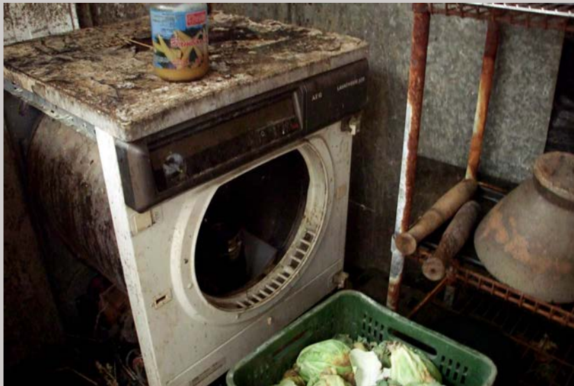
The kitchen used by Thai agricultural workers at a farm in central Israel, November 1, 2014. A former worker said the building was used to store chemicals before the farm owner converted it into living accommodation for workers.