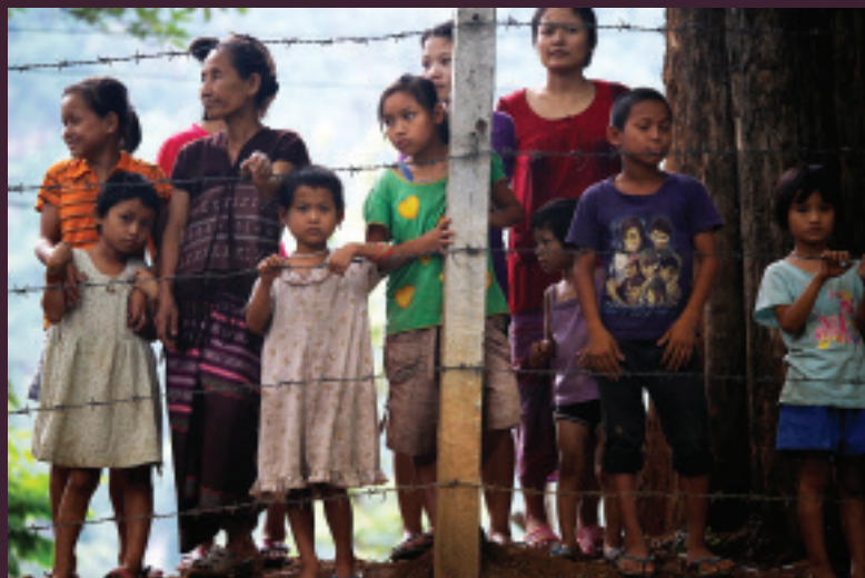
Burmese refugees at the Mae La refugee camp near Mae Sot, Thailand, one of nine refugee camps along the Thai-Burma border, June 2012.

Human Rights Watch urges Thailand to consider an alternative to its current refugee policy, one that would provide all asylum seekers an opportunity to have their claims for asylum heard fairly and would respect the rights of refugees to freedom of movement and to work. Such a policy would contribute to the rule of law in Thailand and reduce opportunities for corruption and exploitation.