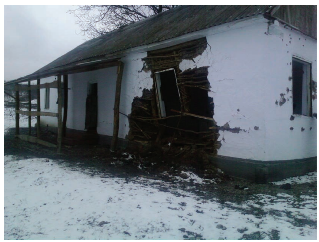
A family home after an FSB raid in the village of Chemulga, Ingushetia.