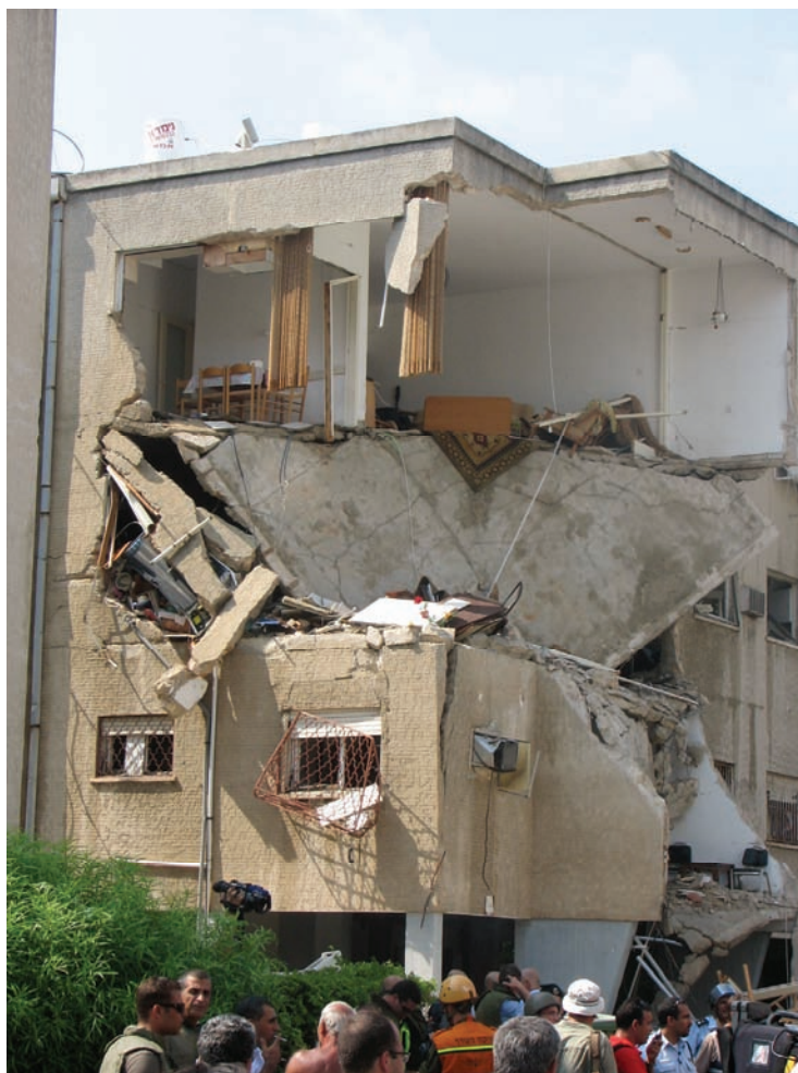
A rocket hit this apartment building in the Bat Galim neighborhood of Haifa on July 17, 2006, wounding six residents.

Haifa Police Chief Meri-Esh believes Hezbollah was aiming mostly at targets in the port area and that the relatively few rockets that reached the upper city were “over-shots.” The problem is that between the port area and the more affluent upper city neighborhoods on the hill are the lower residential neighborhoods, some densely populated. Thus, if Hezbollah was in fact trying to hit objects on the waterfront, its inaccurate rockets, flying a distance of thirty kilometers, stood a good chance of striking—and did indeed strike—residential and shopping neighborhoods just beyond.