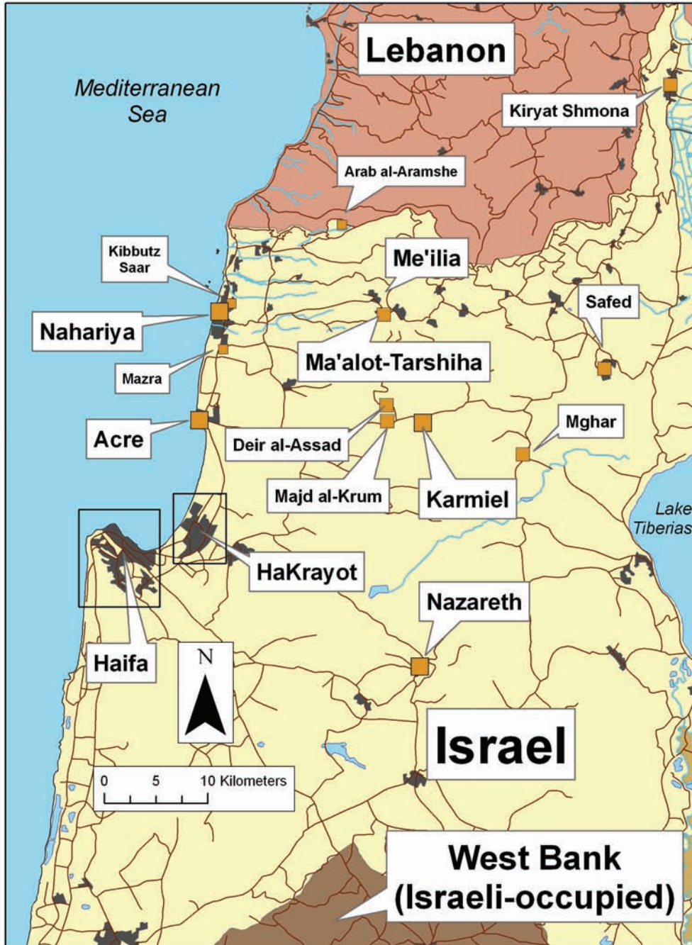
Northern Israel, showing locations struck by Hezbollah rockets that are described in this report.