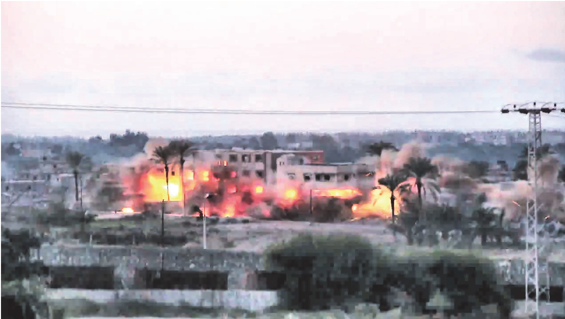
Video shows building demolition with high explosives. Recorded between February 28 – April 12, 2014. Building location: 34°14'19.147"E 31°17'40.744"N.

On September 8, 2013, Hamas spokesman Sami Abu Zuhri told the Washington Post that “there are no tunnels, none, in operation at the current time,” and added that this had never happened before. 117 Nevertheless, in October 2013, Maj. Gen. Ahmed Ibrahim, the commander of Egypt’s border guard, claimed that security forces had destroyed 794 tunnels in 2013, a dramatically higher number than military sources had stated in September. 118 Gen. Ibrahim added that the army planned “to create a ‘safe zone’ in Rafah through which the Egyptian border guard will be able to effectively monitor and secure border areas.” 119