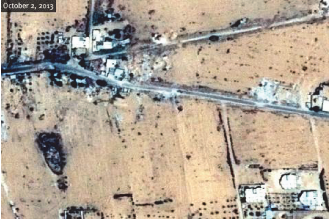
Satellite images shows destruction of cultivated fields, several small buildings and extensive bulldozer tracks on the ground. Recorded on October 2, 2013. Center coordinates: Geo- 34°14'55.998"E 31°15'29.995"N; MGRS- 36RXV1890858905.