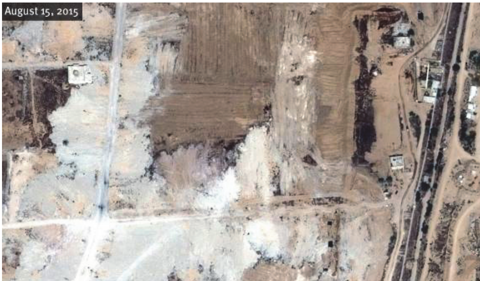
Satellite images showing progression of building demolition in central Rafah between November 1, 2014 and August 15, 2015. Center coordinates: Geo-34°14'41.427"E 31°16'31.33"N; MGRS-36RXV1850260789.