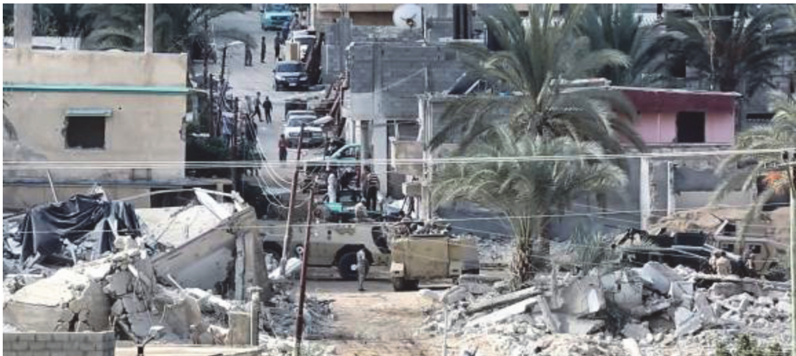
Two wheeled and tracked APCs parked with soldiers observing residents remove their belongings on to pickup truck before demolition. Recorded between October 20 – 31, 2014. Video location: Geo-34°14'28.365"E 31°17'18.796"N; MGRS: 36RXV1814262246.