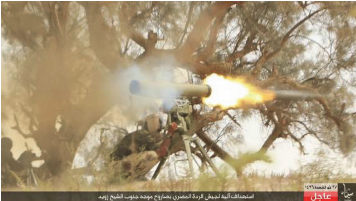
A fighter from the Sinai Province group fires a guided missile at an Egyptian tank near Sheikh Zuweid, September 7, 2015

Clashes between armed groups and Egyptian security forces erupted almost immediately after the outbreak of the uprising. On February 7, 2011, witnesses told a news agency that men they identified as members of the jihadist group Takfir wal Hijra attacked security forces in a two-hour battle in Rafah. 20 On July 29, 2011, armed men attacked a police station in al-Arish, a seaside town 50 kilometers west of the Gaza border, killing an army officer, two policemen and three bystanders. 21 Before the attack, about 100 men had reportedly paraded through al-Arish in cars and on motorcycles, waving flags with Islamic slogans. The night of the attack, armed men also blew up part of a major pipeline that carried natural gas through the Sinai to Israel, the fifth such attack since the uprising. 22 An intelligence officer told the Reuters news agency that the fighters involved in the attack had links to both al-Qaeda and armed Palestinian movements in Gaza. Four days later the newspaper al-Masry al-Youm reported that unknown men in the area had been handing out