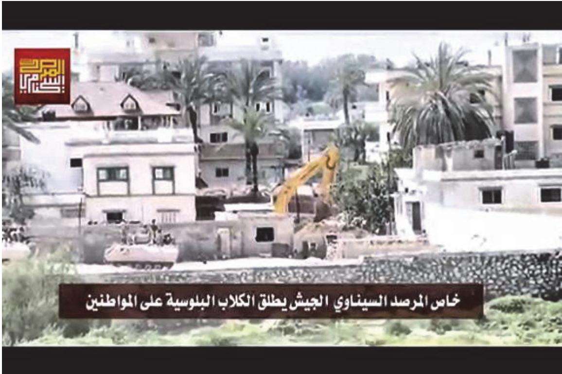
Video shows the active deployment of dozens of Egyptian government soldiers and at least three armored personnel carriers (APCs) next to a military base along the border with Gaza. Excavator is visible in adjacent courtyard demolishing a wall and small building. Recorded between February 28 – April 12, 2014. Video Location- Geo-34°14'20.186"E 31°17'41.961"N; MGRS-36RXV1791762959. Source: https://www.youtube.com/watch?v=01SsydWVCNI