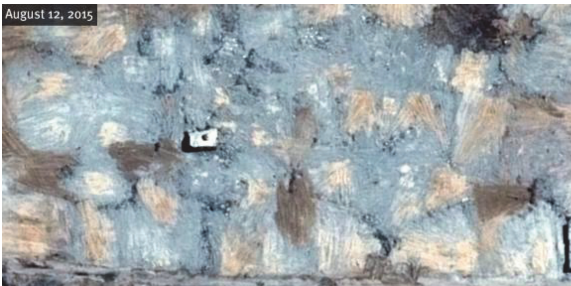
Satellite images show final building demolition in central Rafah between October 5, 2014 and August 12, 2015. Center Coordinates : Geo-34°14'13.106"E 31°17'15.48"N ; MGRS-36RXV1773762140.

Though the renewed threat of violence from insurgent groups in 2014 provided a useful pretext, the Egyptian government had for years taken steps to prepare a buffer zone. In response to pressure from Israel and the United States to more effectively seal the border, former President Hosni Mubarak had ordered a 150-meter-wide strip of land cleared in 2007, but protests forced the government to abandon the plan before it began. Two years