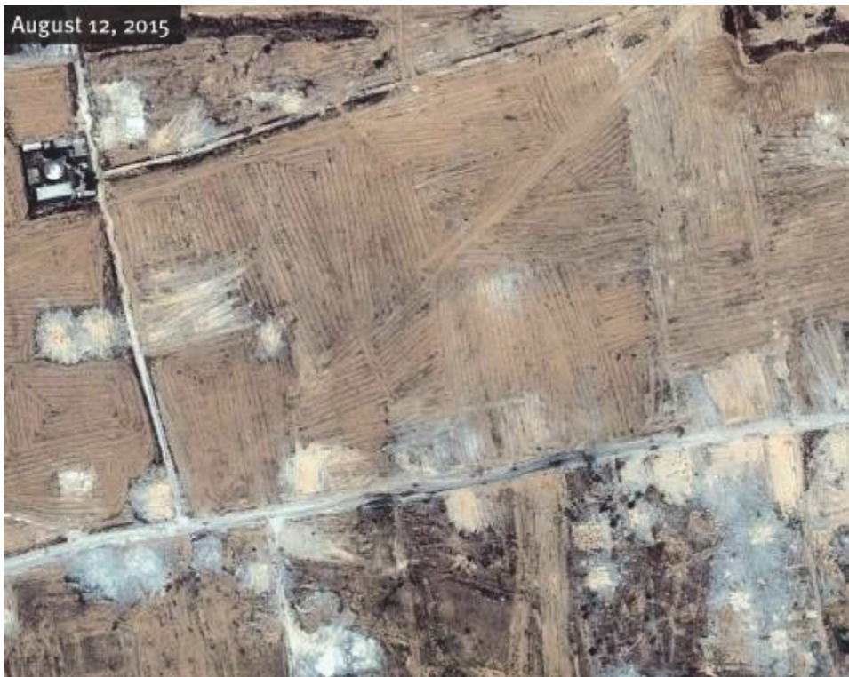
Satellite images showing destruction of farm land in central Rafah between July and October 2013.