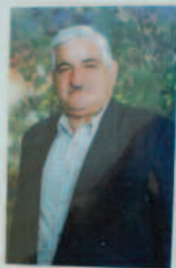
15cm x 22cm