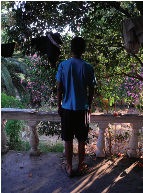
A 14-year-old unaccompanied migrant boy from Afghanistan stands outside the abandoned house in which he lives with 25 other Afghan migrants in Patras, Greece. Like many other migrants, he is trying to stow away on ships to Italy to claim asylum.