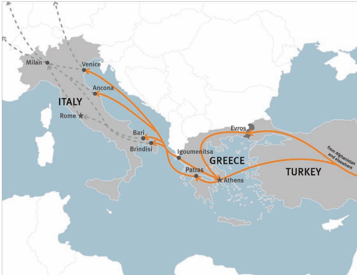
Sample routes taken by migrants and asylum seekers based on testimony collected by Human Rights Watch and other sources.