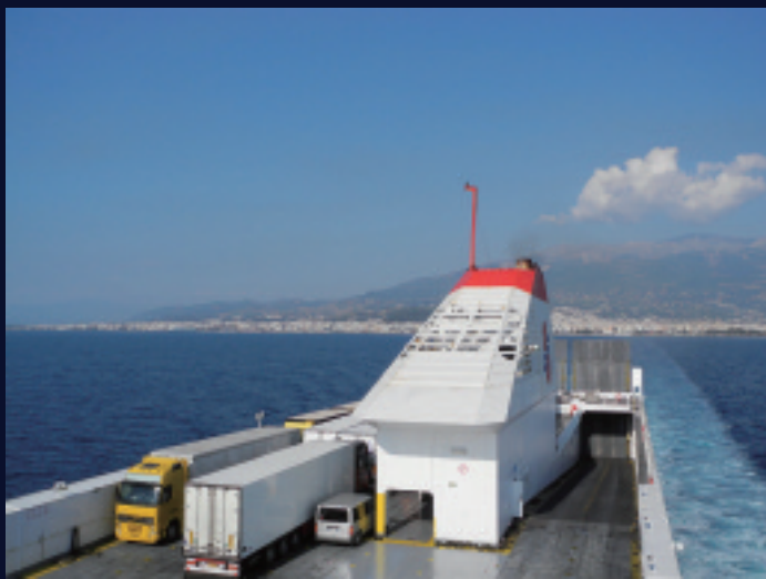
Commercial trucks on ferry between Italy and Greece; Patras port in the background. Migrants desperate to reach Italy stow away between the axles, inside fuel tanks, or inside refrigerated containers of trucks like these.

The report calls on Italian authorities to suspend immediately summary returns to Greece from its Adriatic ports; to admit those claiming to be children and grant them a proper age determination process and best interest determination; and to fully screen migrants who express a fear of being returned for protection needs and give them an opportunity to apply for asylum in Italy.