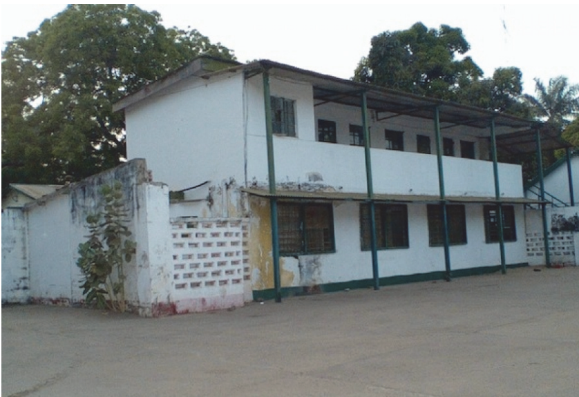
The National Intelligence Agency headquarters in Banjul.

In most cases of torture documented by Human Rights Watch, the abuse took place in the NIA headquarters in Banjul, Mile 2 prison's maximum security wing or an unofficial detention center and often in the presence of senior NIA officials. Even when a different security service was responsible for an initial arrest and detention, torture was almost always carried out by the Jungulers and to a lesser extent by NIA officials.