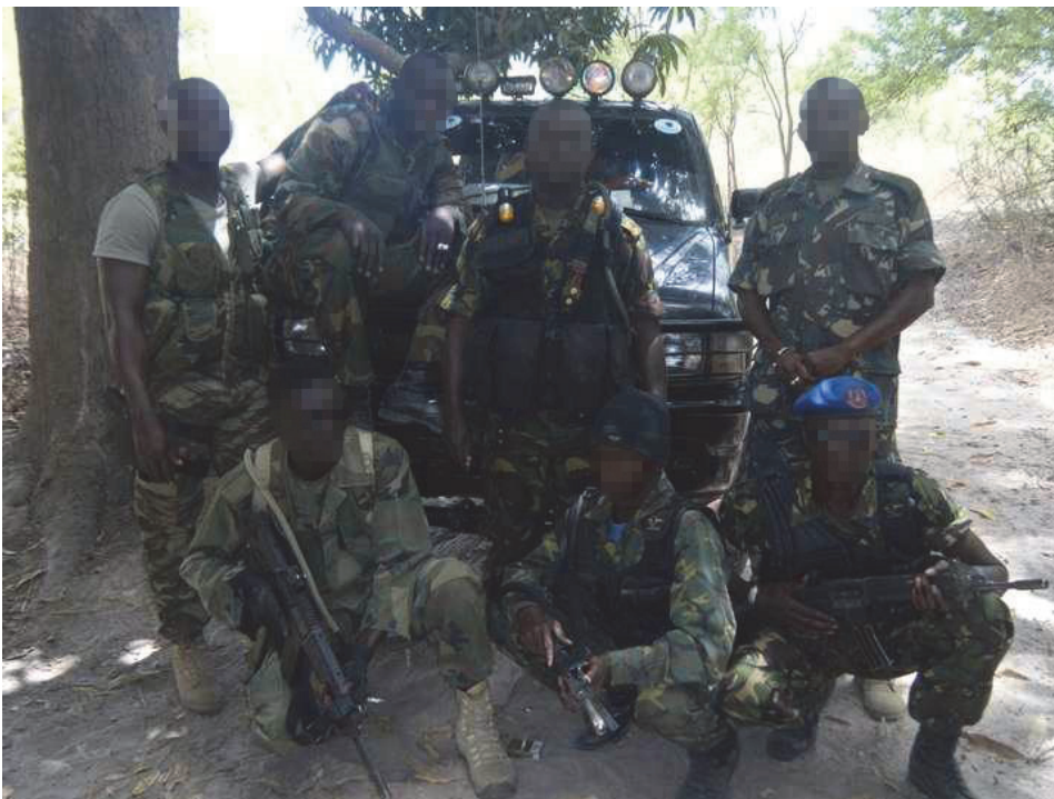
Members of the paramilitary group known as the Junglers, The Junglers have been implicated in serious human rights violations, including torture, enforced disappearances, and killings.

There is also at least one unofficial paramilitary group, known as the “Junglers,” that former members and other government insiders believed reports directly to the executive and operates outside the structure of law enforcement agencies.