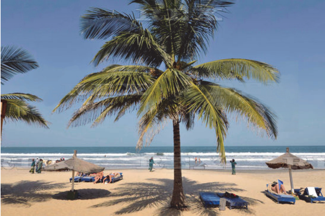
Gambia is known for its beautiful beaches, such as this one south of Banjul.

The Republic of The Gambia is the smallest country on continental Africa, with a population of roughly 1.9 million, 1 and a land mass about the size of Jamaica 2 . Save for a western seaport, the country is surrounded by Senegal and is known abroad for its beaches, wildlife, and lively culture that attract tourists largely from Europe.