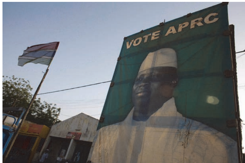
A billboard, with the image of President Yahya Jammeh, urging people to vote for Gambia's ruling party, the Alliance for Patriotic Reorientation and Construction (APRC), in Serekunda, a town west of the capital, Banjul.

Despite nurturing the pretense of democratic governance, Jammeh has, over the last two decades, consolidated power in the executive