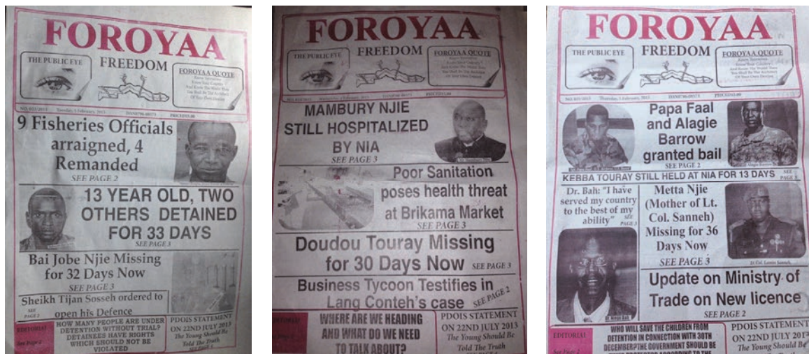
Foroyaa (meaning “freedom” in local Mandinka language), a print and online newspaper based in Banjul, reports alleged arbitrary detentions and enforced disappearances.

NIA can arrest anybody. They have officers in the army; they have people in every sector of the Gambian life. So, you cannot know the strength. They cover the country. You cannot know them. They could be your own sister...They are responsible for anything. They can arrest and torture. They have been given the power to arrest, detain, torture, anything, anytime... to arrest, even detain incommunicado. 40