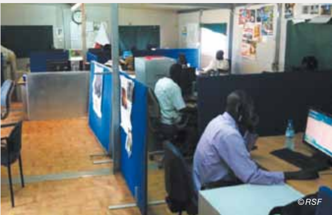
Radio Miraya FM in Juba