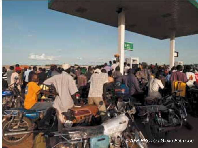
A line outside a service station – a photo that could give you problems.