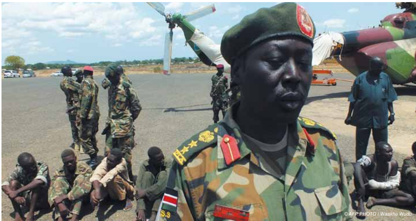
Philip Aguer, chief of staff of South Sudan's armed forces

The No. 1 problem raised by all the people Reporters Without Borders talked to during its visit is the brutality of the security forces and the Sudan People's Liberation Army (SPLA), as South Sudan's armed forces are called.