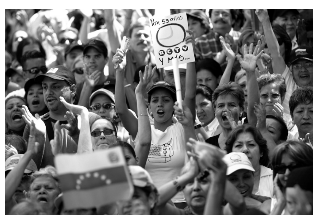
Workers and supporters of RCTV rally in Caracas. The sign reads: "For 53 years, and more, RCTV."