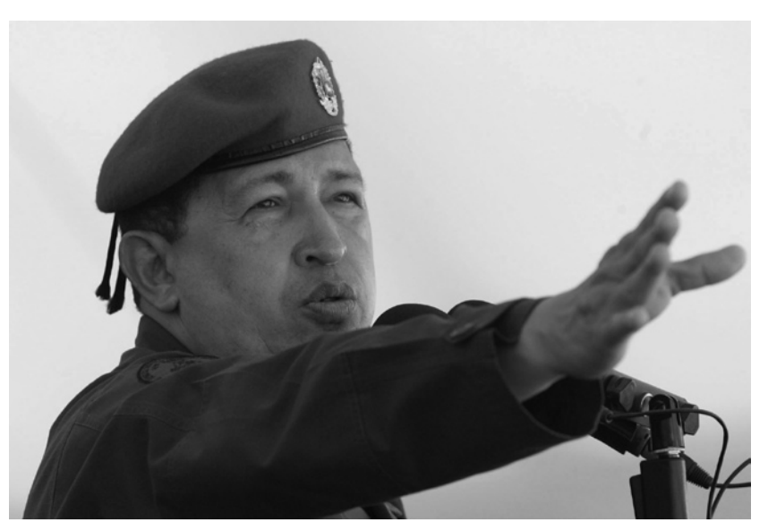
President Hugo Chávez says he will not renew RCTV's broadcast license, calling it a "coup-mongering" station.

Yet the White Book , published by the Ministry of Communication and Information, does include 45 pages of documents outlining alleged RCTV