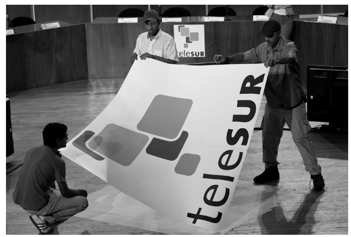
Workers erect a sign for Telesur as the regional news channel gets set to launch in July 2005.