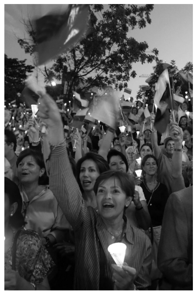
Government opponents wave flags during a 2002 demonstration.

violations of broadcast laws. The citations on their face appear to be minor; the book offers no means to gauge their severity, to judge them against established government standards, or to compare them against the records of other broadcasters. The government, for example, cited RCTV for covering a well-known murder case in a "sensational" manner and for showing alcohol consumption during a professional baseball game. The government also chided the station for calling the Law of Social Responsibility in Radio and Television—which sets broad content restrictions on broadcasters—as the "content law" in its news broadcasts. Other accusations against RCTV—such as promoting "pornography"—are not cited in the book even though they were made publicly by top officials.