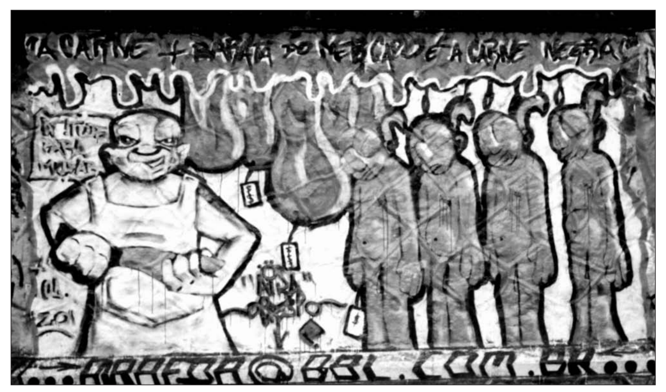
A mural in Rio showing black corpses with bullet wounds reads "A carne mais barata do mercado é a carne negra" ("The cheapest meat is black meat"). According to figures compiled from press reports in 1999 by the National Movement of Human Rights (MNDH), the highest proportion of racially identifiable victims of extrajudicial executions were black.