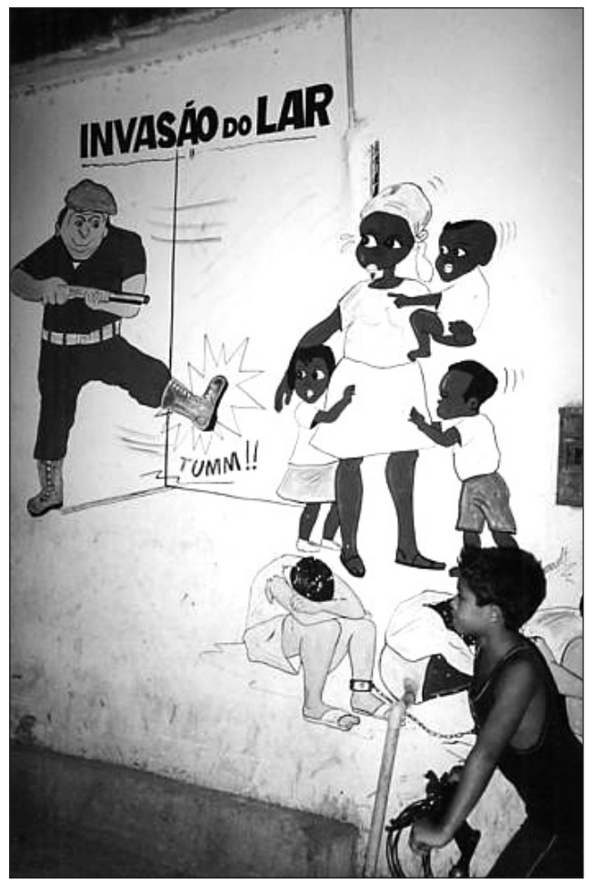
A mural in Rio shows the popular perception of policing in the city's poor communities. "Invasão do Lar" means, "Invasion of the home".