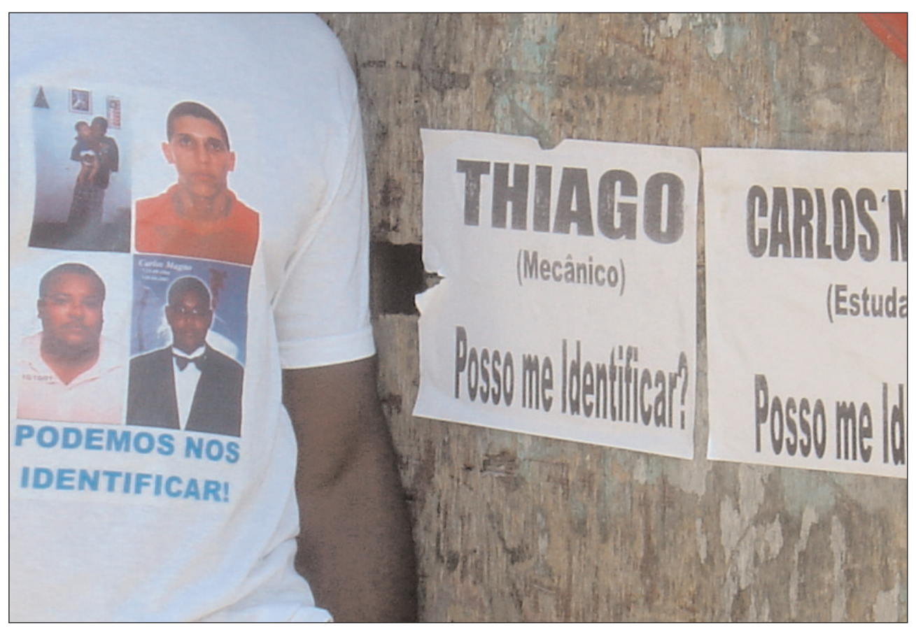
A T-shirt worn by a relative shows the four men who died in Borel on 17 April 2003. The names of the victims and the phrase ' Posso me identificar? ' ("Can I identify myself?"), were posted up around the community after the killings.