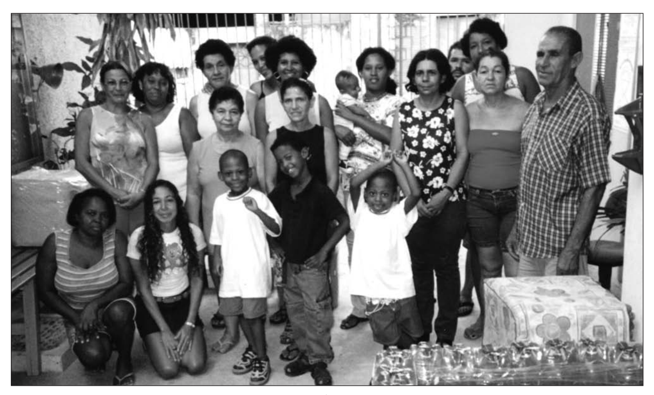
Relatives of the victims of the Candelária and Vigário Geral massacres, and the Acari "disappearances" in Vigário Geral, April 2002.