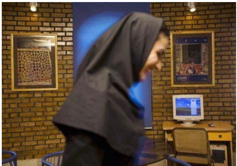
A woman at an Internet café west of Tehran.

"Some topics, because of a culturally conservative culture, cannot appear on the pages of a newspaper. If you publish them you will be flooded with complaints from readers, even if no objection from the authorities is forthcoming," said Khaled El-Sergany, editor of the Egyptian daily Al-Dustur . "But bloggers don't have to answer to a cultural censor; their readership is more progressive, generally speaking. When they raise certain issues, which then gain traction, it becomes more palatable if we then cover them."