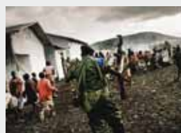
Kibati camp for displaced people, DRC.

People displaced in conflict (and on return home) often find themselves in contact with people carrying weapons in various guises. Equally, people carrying weapons are themselves generally mobile, whatever their relation to a conflict or its aftermath. In particular, members of security forces in situations of forced displacement can be agents of positive change in relation to HIV and AIDS – or part of the problem.