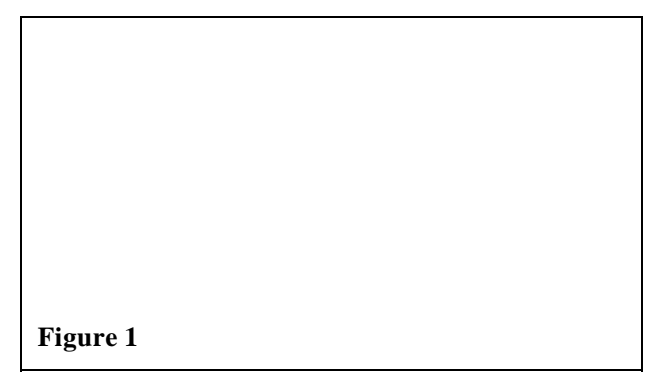
The Angolan town of Calai photographed from Rundu in Namibia.

heard shots. They also saw two other groups of people, including women and children, being led off in other directions. A few days later journalists crossed into Angola taking a video camera. They filmed bodies which had begun to decompose in the intense heat. They said they had seen six bodies in two groups of three each not far from the village of Halukombe. One of the victims appeared to have a bullet hole in the forehead. The journalists also observed signs indicating an attempt to burn the bodies. These