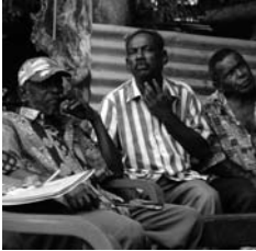
Indigenous Fijians and Indo-Fijians participate in a Citizens' Constitutional Forum community education workshop in the Ba province, Fiji.