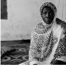
Haratine woman, Nouakchott.