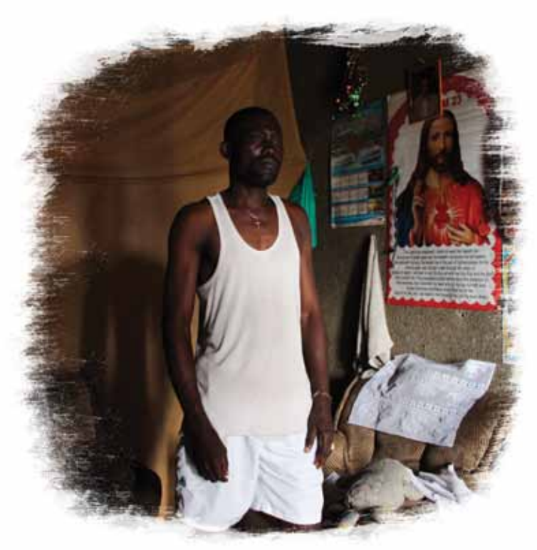
A soldier at home in his barracks, Katindo Camp, Goma

ensuring salaries reached individual soldiers - undertaking a census of FARDC personnel, developing a 'logistics doctrine' for the FARDC, and conducting administrative training. The census started in 2006, and has been able to offer a far more reliable idea of numbers of serving soldiers than was previously available<sup>83</sup>. The strategic purpose of interventions matters more than their cost.