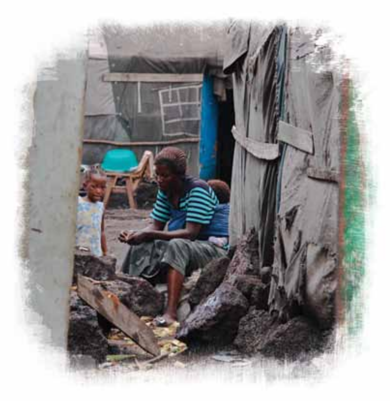
A military family living in Camp Katindo, North Kivu, Most families in the sprawling army camp live in tents or makeshift structure

24. Regional organizations, most importantly the African Union (AU) and the Southern Africa Development Committee (SADC) have a pressing and legitimate interest in regional prosperity and stability. And the international financial institutions - frequently cited as the actors with the most significant leverage and access in Kinshasa<sup>71</sup> - are committed to helping the DRC achieve sustained economic growth. The IMF is the only actor currently providing direct budget support to the DRC government<sup>72</sup>.