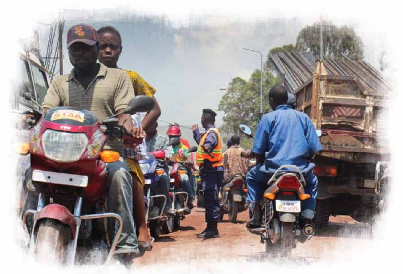
Congolese police patrol the main streets of Goma