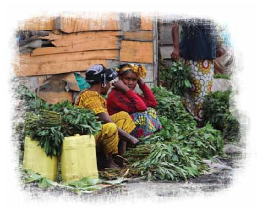
Military wives seek to supplement their income with small-scale trade in the local markets. "We have to beg or support from our acquaintances. The government does not support us at all," said one soldier