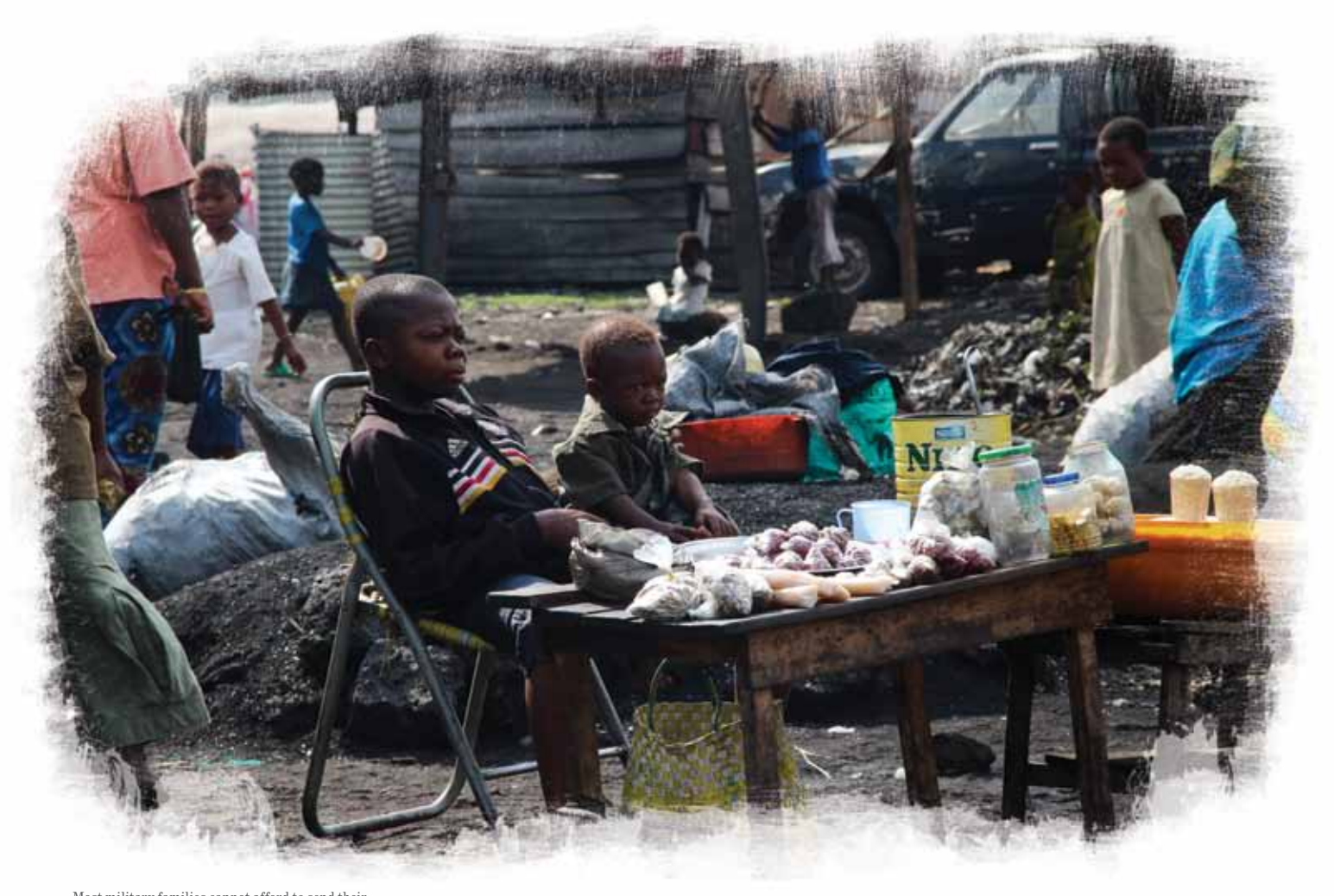
Most military families cannot afford to send their children to school. Children often work from a young age to contribute to the family income.