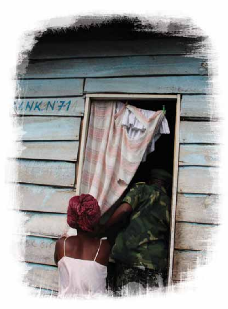
Officers' Quarters at Camp Katindo in Goma, North Kivu province. Originally intended to house 150 people, the camp is now home to more than 16,000 people including many soldiers' families.

6. Yet despite this consensus, military reform efforts have failed, both during the transition and afterwards. They have failed for two primary reasons. The first is the lack of political will on the part of the Congolese government; the second inadequate and poorly coordinated assistance from the donor community.