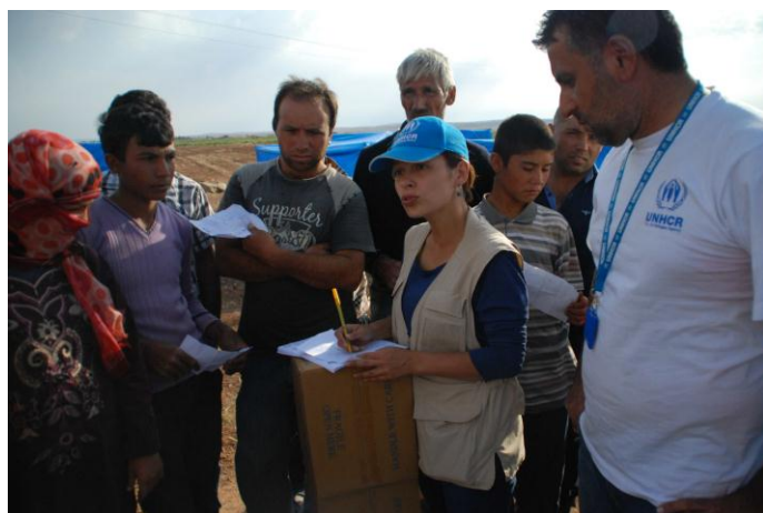
UNHCR delivery of CRIs to families living in make-shift shelters in fields next to Kizilhoyuk village Suruc.

UNHCR hosted an Inter-Agency meeting in Gaziantep on 01 October. During the meeting UNHCR gave a detailed gap analysis presentation with inputs from needs analyses conducted by INGOs IMC, CARE, DRC, IRC, and Turkish NGOs IMPR and Support to Life. These assessments covered 10 official and non-official shelters and the needs identified per sector were discussed in the meeting.