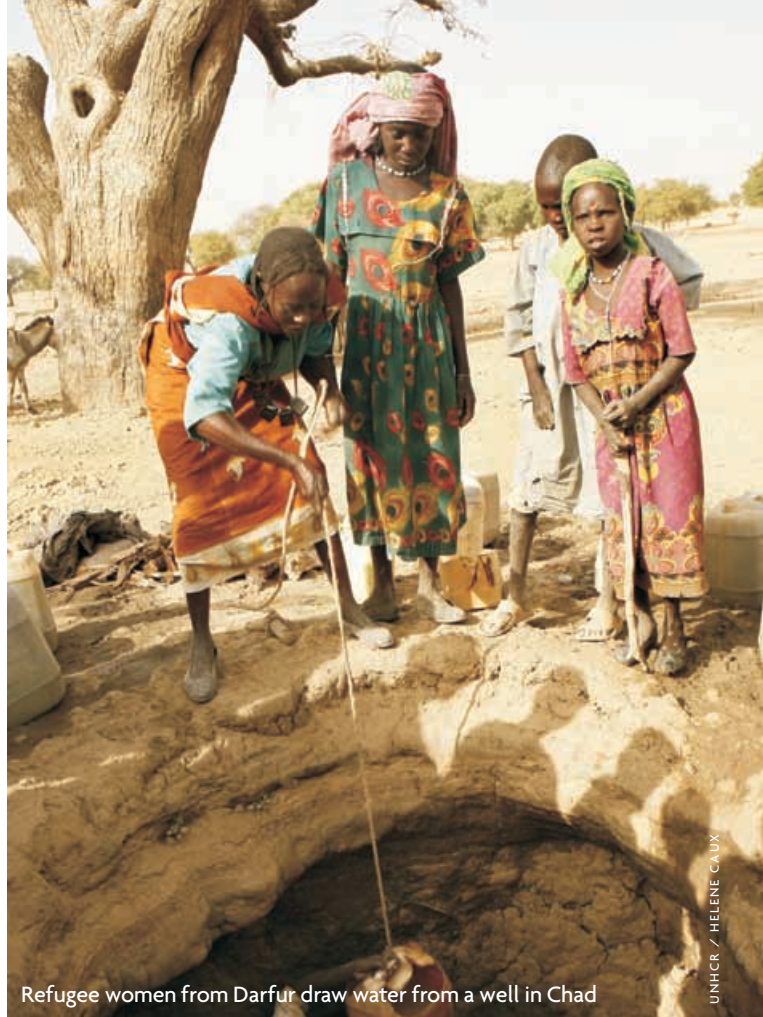
Refugee women from Darfur draw water from a well in Chad

Crop production: In eastern Chad some 27 per cent of refugee households improved their own food production through an increase of the cultivated land area. In southern Chad, crop diversification was intensified to include rice, sesame and potato and vegetables, all of which provided important sources of income for refugees. Rain-fed production increased on average by 60 per cent as more land was cultivated and better farming techniques were employed. As a result, refugees were able to cover almost half of their overall food needs.