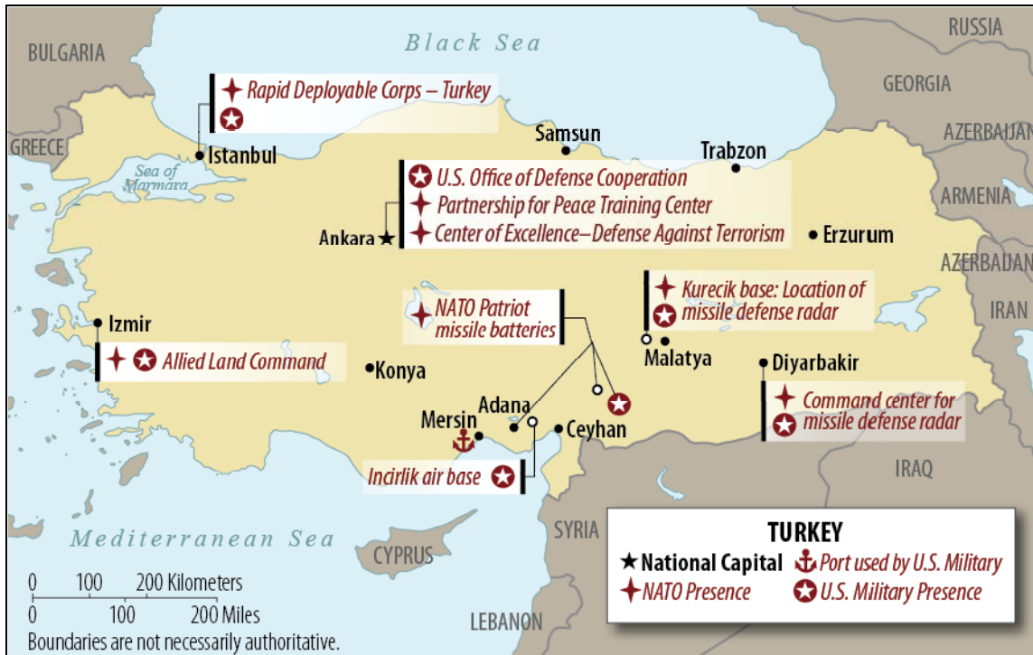
Figure 3. Map of U.S. and NATO Military Presence and Transport Routes in Turkey