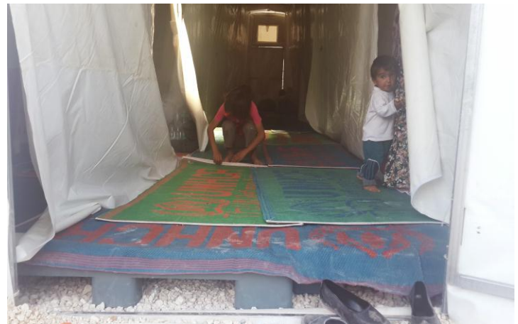
Syrian children in a shelter at Onbir Nisan.

A group of 7 families spontaneously arrived at YIBO shelter on 8 October, but could not be admitted because the temporary shelter has reached its maximum capacity of 3,900 persons. Therefore, AFAD officials referred these families to the temporary shelters set up at Onbir Nisan centre and at Suruc Sports centre.