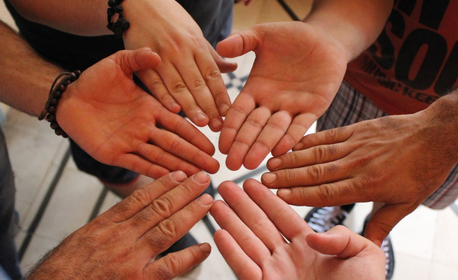
Lesbian, Gay, Bisexual, Transgender and Intersex (LGBTI) youth participate in a group team-building exercise during the monthly meeting of the LGBTI Youth Group in Lebanon.