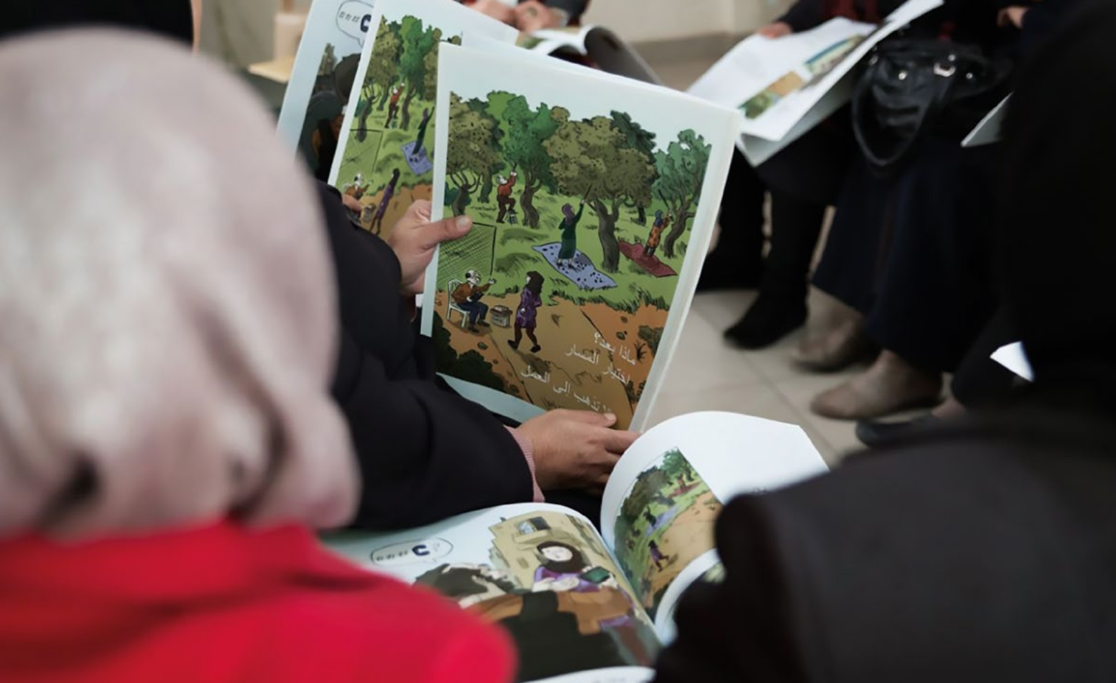
Syrian refugee and Lebanese women and adolescent girls participate in an age-appropriate SGBV support group to strengthen coping skills, decision-making and healing.