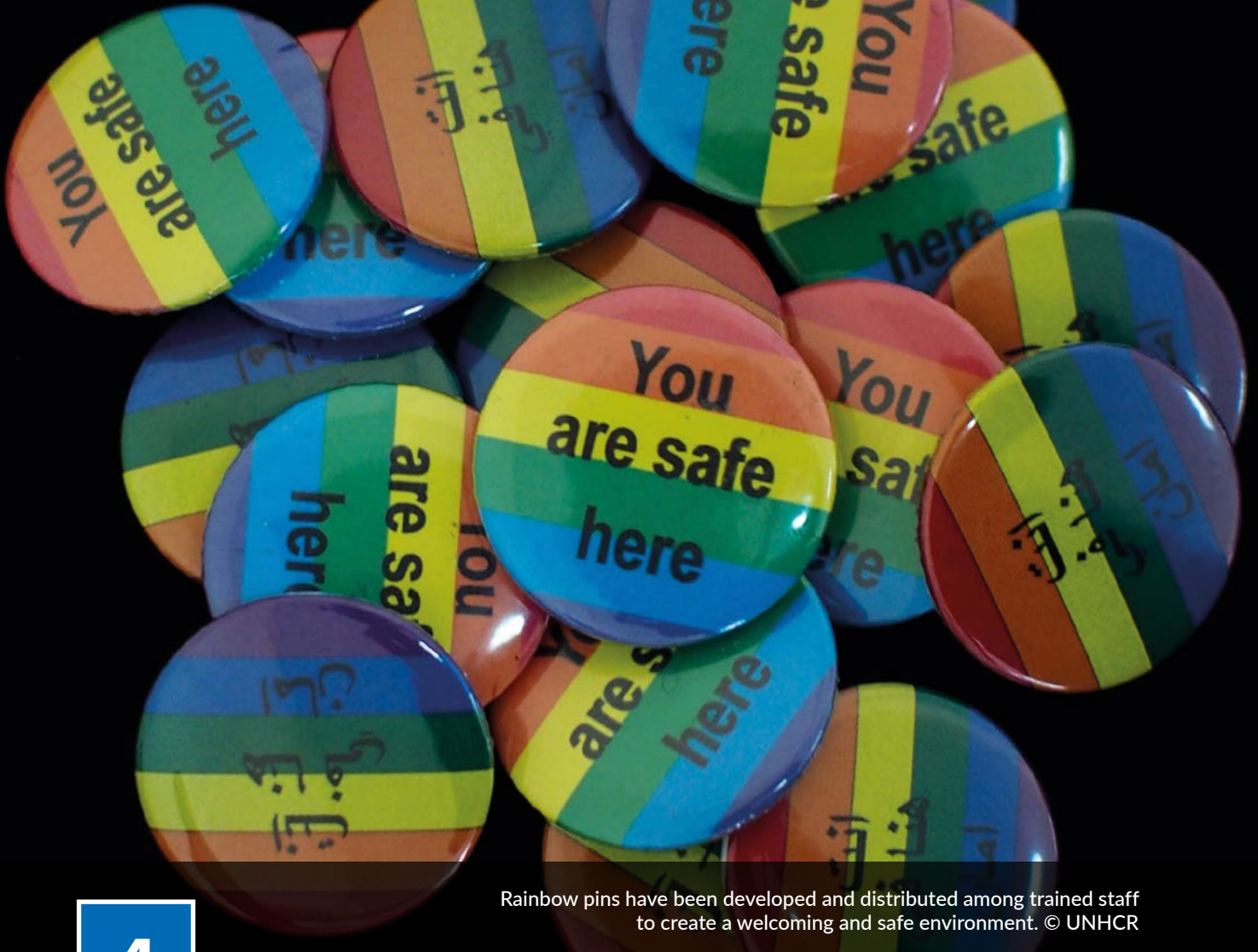
Rainbow pins have been developed and distributed among trained staff to create a welcoming and safe environment.