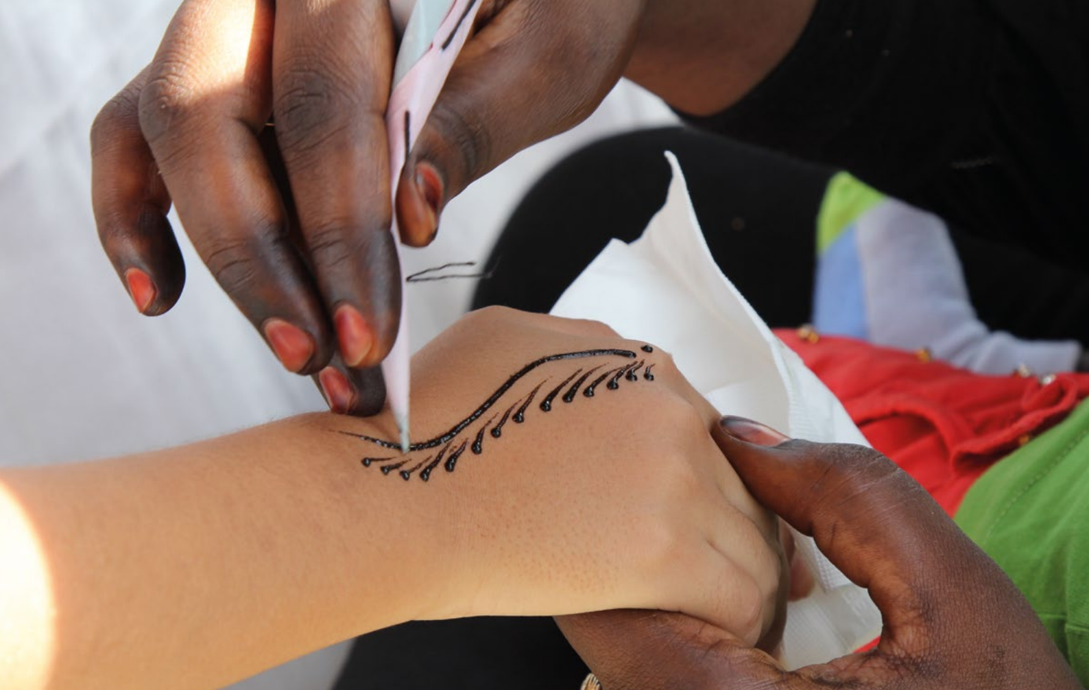
A Sudanese woman applies a henna design on a Syrian child's hand during the UN Day celebration in Cairo, Egypt.