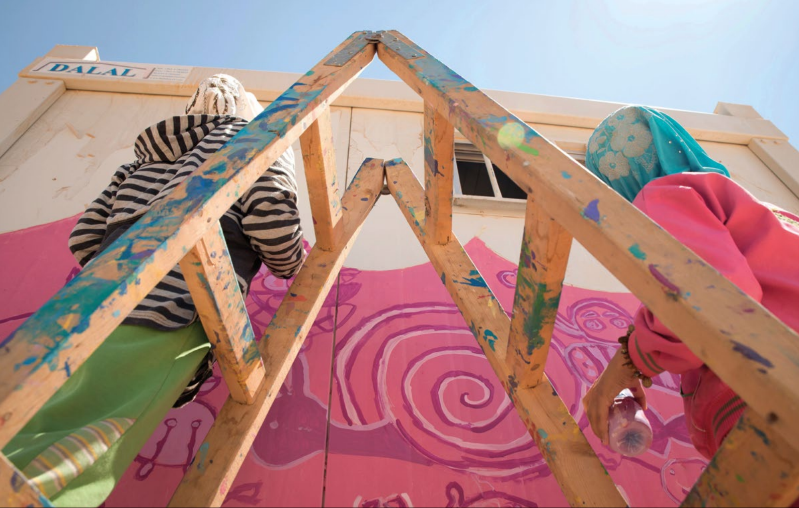
Young Syrian refugees add a dash of color – and enjoyment – to the Za’atari refugee camp in Jordan.