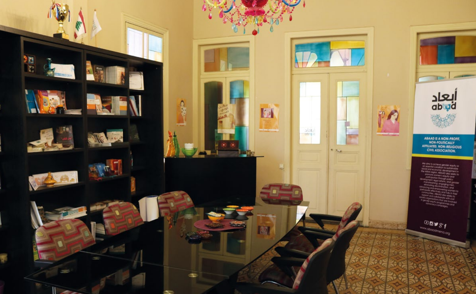
From their main office in Beirut, Lebanon, ABAAD operates the Emergency Midway House program for women and girls, providing physical shelter, rebuilding networks and promoting self-reliance.