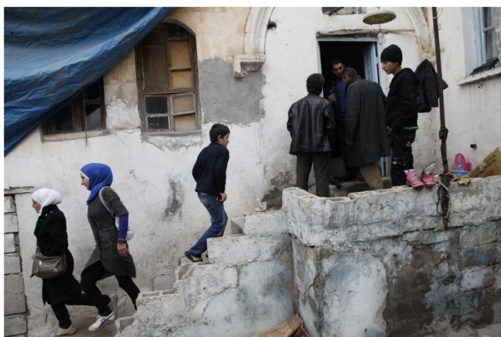
Hasan. has a big family of 12 members. They live in one rented room in Nizip and share kitchen with others. They are eager to find some daily labour so that they can pay the landlord; otherwise they may have to return to Syria. UNHCR / Aytunc Akad / December 2013 (Name changed for the protection of the refugee.)

IDMC, part of the Norwegian Refugee Council (NRC), launched its Global Overview 2014 at the United Nations in Geneva, alongside the UN Refugee Agency (UNHCR). The report, which covers internal displacement in 2013, highlights that a full 63% of the record breaking 33.3 million internally displaced people (IDPs) reported worldwide come from just five countries: Syria, Colombia, Nigeria, Democratic Republic of Congo (DRC) and Sudan.