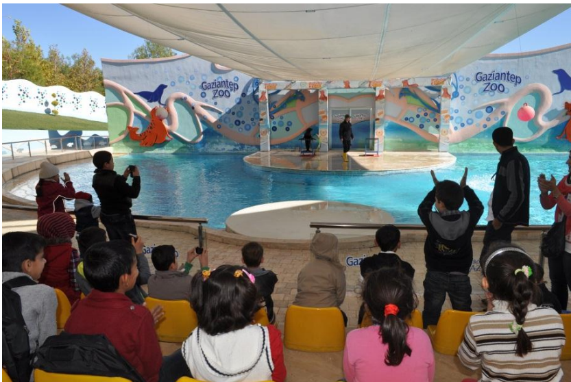
Syrian refugee children visiting the Gaziantep zoo on 05 November

As part of the UNHCR-funded Gaziantep Community Centre's programme for children's psychosocial activities, implementing partners IMC/ASAM promoted a visit to Gaziantep zoo for a group of 34 Syrian urban refugee children from Gaziantep. The center's psychologist explained that this initiative aims to increase the children's sensitivity to their surroundings, teach them how to act as part of a group and to take care of each other. Many children took part together with their younger or older siblings. Educational and psychosocial activities are extremely important to create a sense of normalcy, promote social interaction and break the monotony of life in asylum.