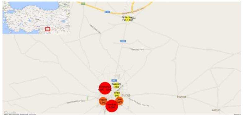
Estimated figures of Syrians living in the central districts of Suruc as of 04 November 2014

However, the need for more shelters presses on. As YIBO School has reached its capacity, the Şanlıurfa Deputy Governor has expressed the idea to set up two to three additional extension of residential areas to should the need for more shelters continues.