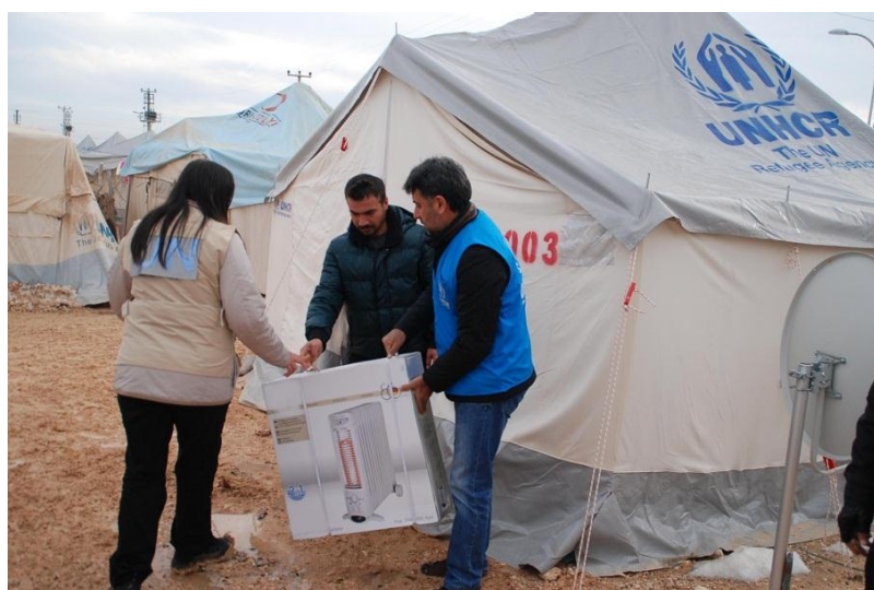
Refugee head of household received a heater from UNHCR in a refugee camp

UNHCR Turkey's winterization plan targets assistance to 300,000 refugees in host communities and some 120,000 refugees in camps. In total, if fully funded, 84,000 families will benefit from winterization assistance. The plan includes distribution of high thermal blankets to 84,000 families and winter clothing to a targeted refugee population of 60,000 households (300,000 people) not living in the camps.