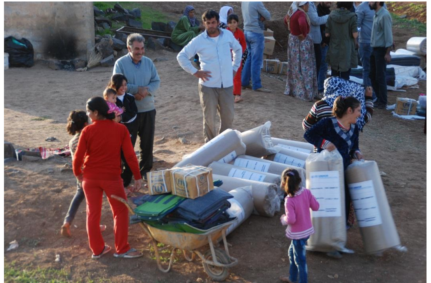
Syrian refugee family collecting mats and foam mattresses during distribution in Suruç Town.

On 03 November, UNHCR officially introduced Concern and ASAM as new Implementing Partners for core relief items distribution on the Suruç area to the humanitarian community and Turkish authorities. UNHCR has already begun to train the new implementing partners on distribution of relief items during emergencies.