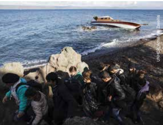
Refugees from Iraq and Syria arriving on Lesbos having crossed by boat from Turkey.

Levels of xenophobia and Islamophobia seem sure to rise unless a larger international effort is harnessed to link the groundswell of