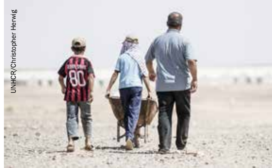
Long walk for groceries for Syrian refugees at Azraq Camp, Jordan, June 2015.

In order for this model to work, there would need to be Association Agreements between regional host states and the EU. Alongside such agreements, a legal framework that facilitates capital flows and protects all parties involved would be put in place to minimise risks. Importantly, the EU's Rules of Origin requirement needs to be reconsidered in order to allow for refugee labour in production and for exports to be allowed to reach European markets. While the EU's Rules of Origin are global and have been