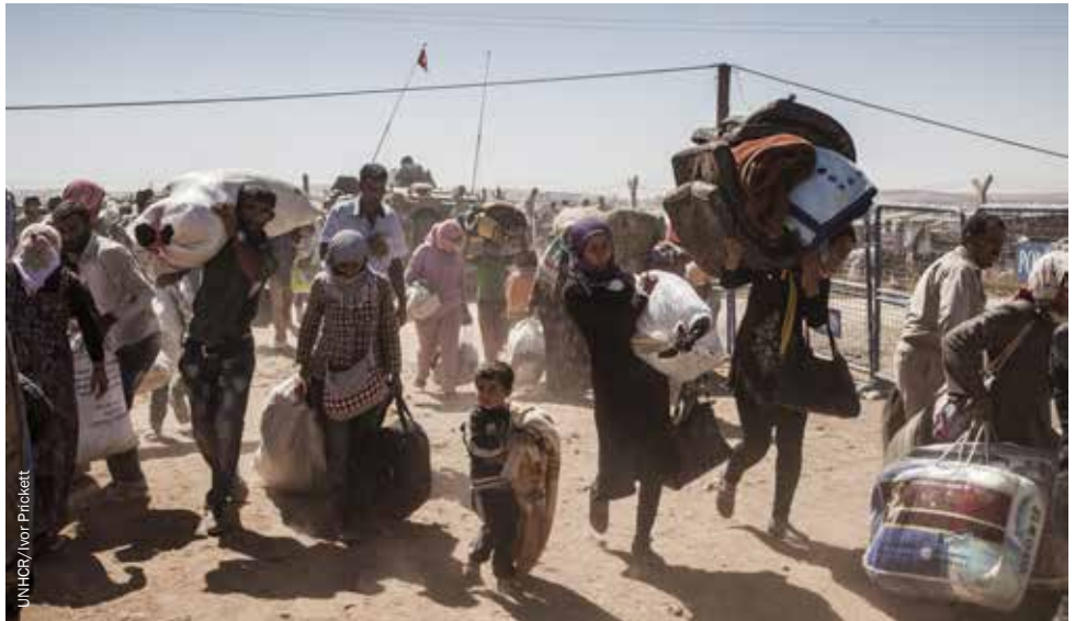
Syrian Kurdish refugees cross into Turkey from Syria, near the town of Kobani.

EU law also establishes the concept of the ‘safe third country’, which permits Member States to refuse to admit claims from applicants who have come through a country which satisfies specified legal criteria for their safety. These include ratification and observance of international refugee law instruments and a functioning asylum system, legislation and institutions. However, the EU Asylum Procedures Directive acknowledges that the presumption of