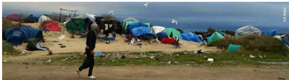
Calais, France, November 2015.

Emeritus Professor of International Refugee Law, University of Oxford www.ox.ac.uk