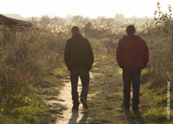
Two Afghan men waiting to meet their smugglers walk through the grounds of a Serbian brick factory where dozens wait for a chance to get across the Hungarian border.

case is separate from the migrant's right to request asylum. That right exists regardless of whether asylum is eventually granted.