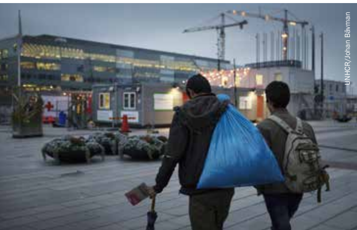
Unaccompanied minors from Afghanistan in Malmö, Sweden, November 2015, on their way to a temporary arrival hall (set up by the municipality to provide toilets, showers, wifi and electricity) before going to the immigration office where they can apply for asylum.

differences in treatment of unaccompanied children depending on the different instruments which apply to them, the EU also made serious efforts to emphasise their common rights first and foremost as children through the implementation of an EU Action Plan on Unaccompanied Minors 2010-2014 5 which also sought to address some of the more difficult issues concerning all unaccompanied children, such as guardianship, age assessment, family tracing and durable solutions.