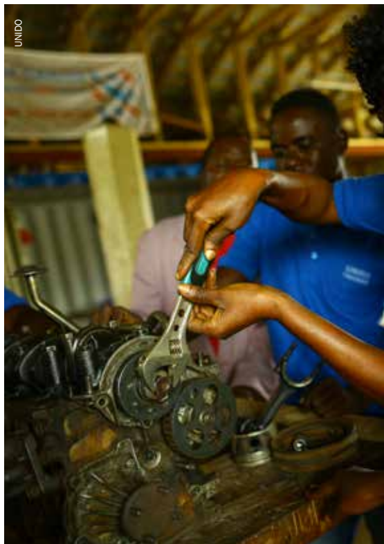
Automotive Servicing Training at NETLIB Vocational Training Institute.