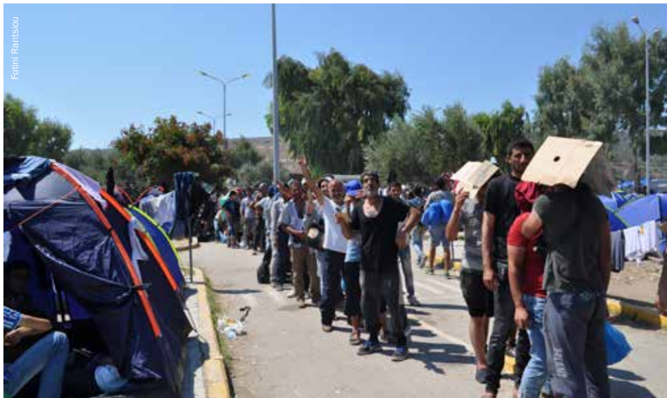
Lining up for registration in the camp for Syrians on Lesbos.

initially prohibited for private vehicles to give them a lift before they receive their registration papers but even then many locals were giving lifts to the old, the injured, families with babies and pregnant women, at the risk of arrest for violation of anti-trafficking laws. And there are taxi drivers that charge hundreds of Euros to bring the refugees and migrants into town.