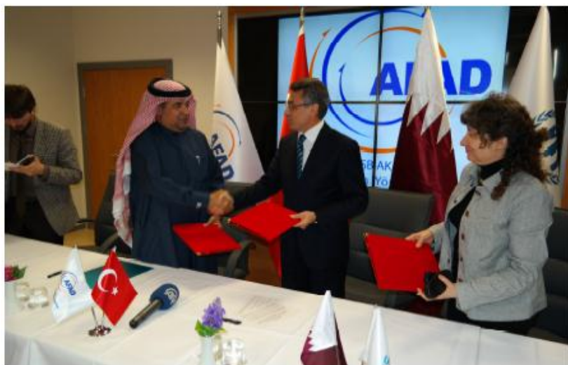
UNHCR, Qatar Red Crescent and AFAD signing a cooperation protocol to confirm their cooperation on provision of emergency winter relief materials to Syrian refugees through the funding provided by the State of Qatar.

dollars for the winterization program. This Qatari grant comes at the command of His Highness Prince of the State of Qatar in order to relief the Syrian families facing the difficult circumstances and harsh cold, and in solidarity with the efforts of Turkey in providing relief services to the Syrians. The program includes: 7,000 highly-durable family tents and 315,000 high thermal blankets for Syrians inside and outside of camps who have fled Syria to seek protection in Turkey.