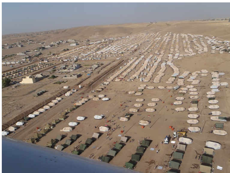
The Kawergosk camp will soon have capacity to host 20,000 people. UNHCR