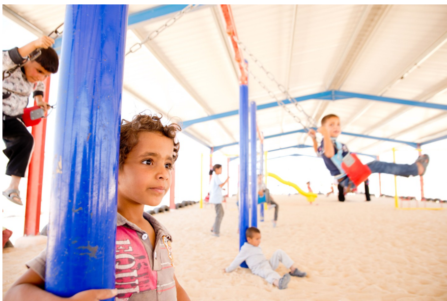
Children playing in a UNICEF/Save the Children Child Friendly Space in Za'atri camp, Jordan.

• Turkey - In preparation for the new academic year, AFAD will be providing a prefabricated school with in Adiyaman Camp. UNICEF, UNHCR and UNFPA are working on the development and roll-out of libraries in the camps, including the supply of books. A back-to-school shoe distribution campaign was launched on 15 August to distribute 80,000 pairs of shoes to children in all camps through the Turkish Red Crescent Society. The distribution of shoes was provided to encourage children to attend school and provide additional protection as the weather gets colder.