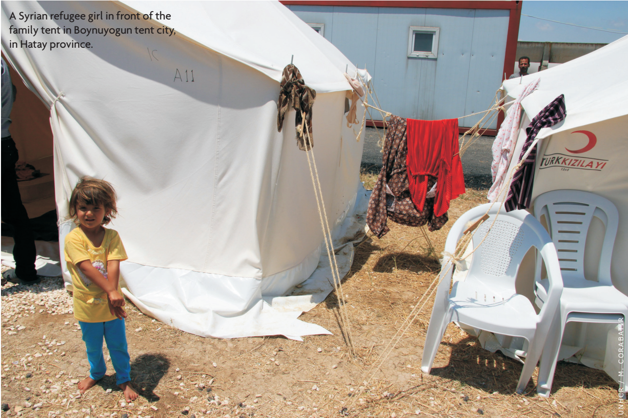
A Syrian refugee girl in front of the family tent in Boynuyogun tent city, in Hatay province.