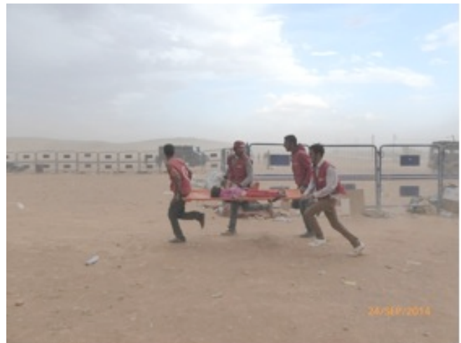
Turkish Red Crescent staff running to ensure emergency health care with a child on a stretcher at Yumurtalik border crossing, photo: UNHCR/ F.Ozdogru

From 19 until 24 September, 840 refugees received medical attention (600 out-patients and 240 ambulance arrivals). It was confirmed that one of the three mine explosion victims reported on 24 September passed away. The other two are under intensive care unit at the Harran Education and Research University Hospital in Urfa.