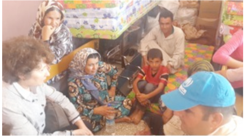
The UNCR Turkey Representative talking with a refugee family in YIBO boarding school

At another point at the border, 500 meter east of Akmanak, UNHCR witnessed around 300 cars lined up for about 1 km. As far as the UNHCR teams could see