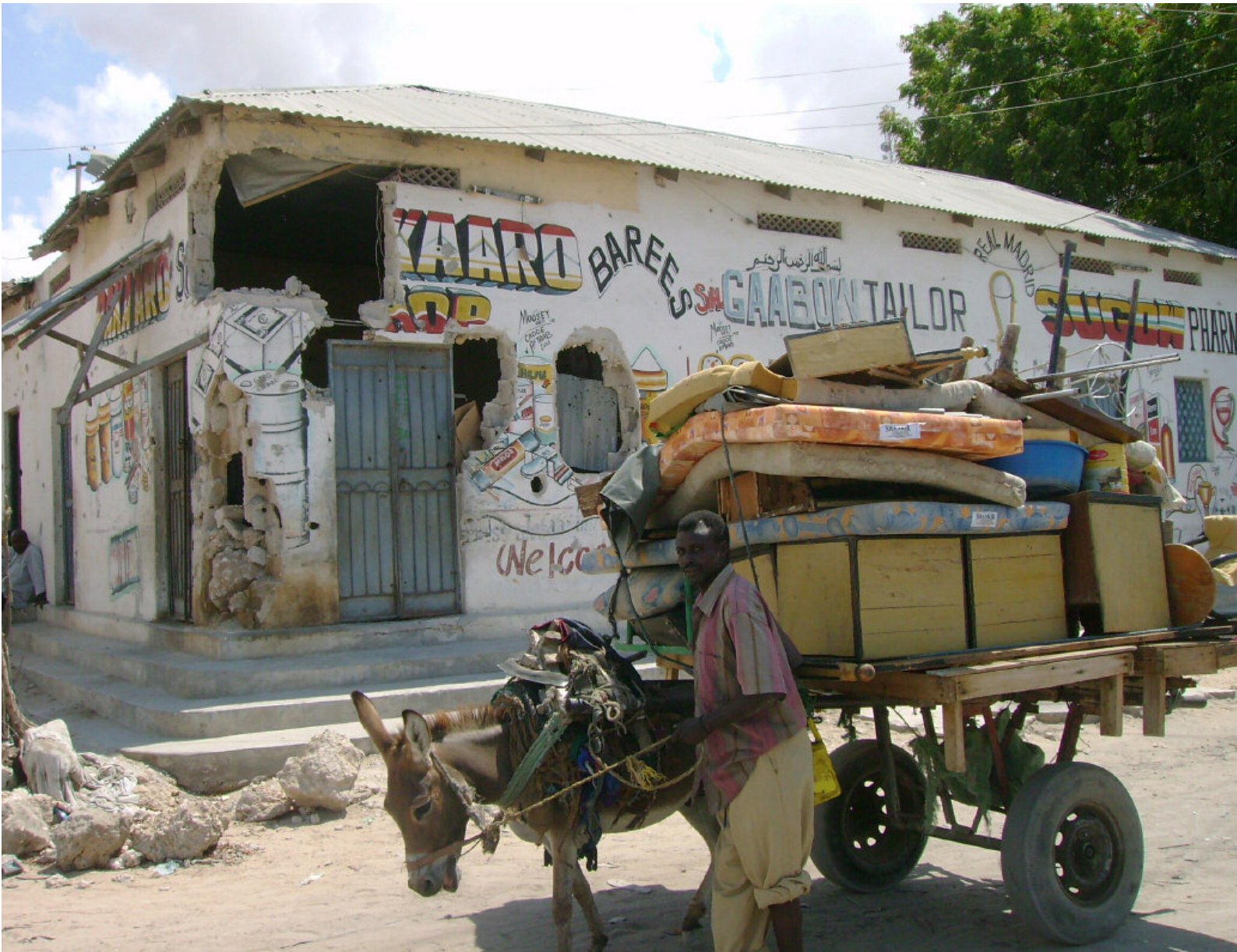
Displaced man near Hawlwadak, Mogadishu, April 2008.

suppress breaches of international law and prosecute those responsible for war crimes. War crimes may also be prosecuted in another country on the basis of universal jurisdiction.