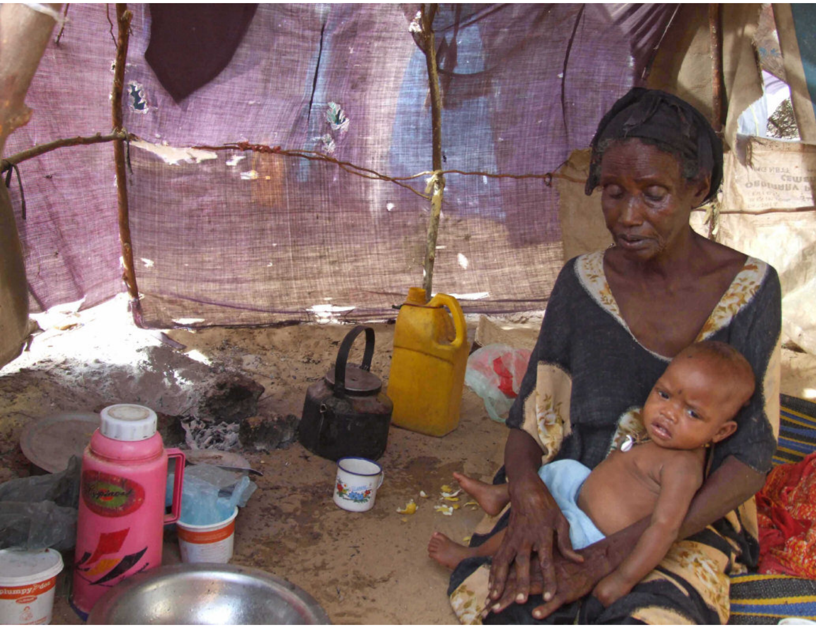
A blind woman, with her granddaughter, in Elasha camp for the internally displaced, April 2008. She was forced to flee from Baidoa in 1998, and from Mogadishu in 2007.