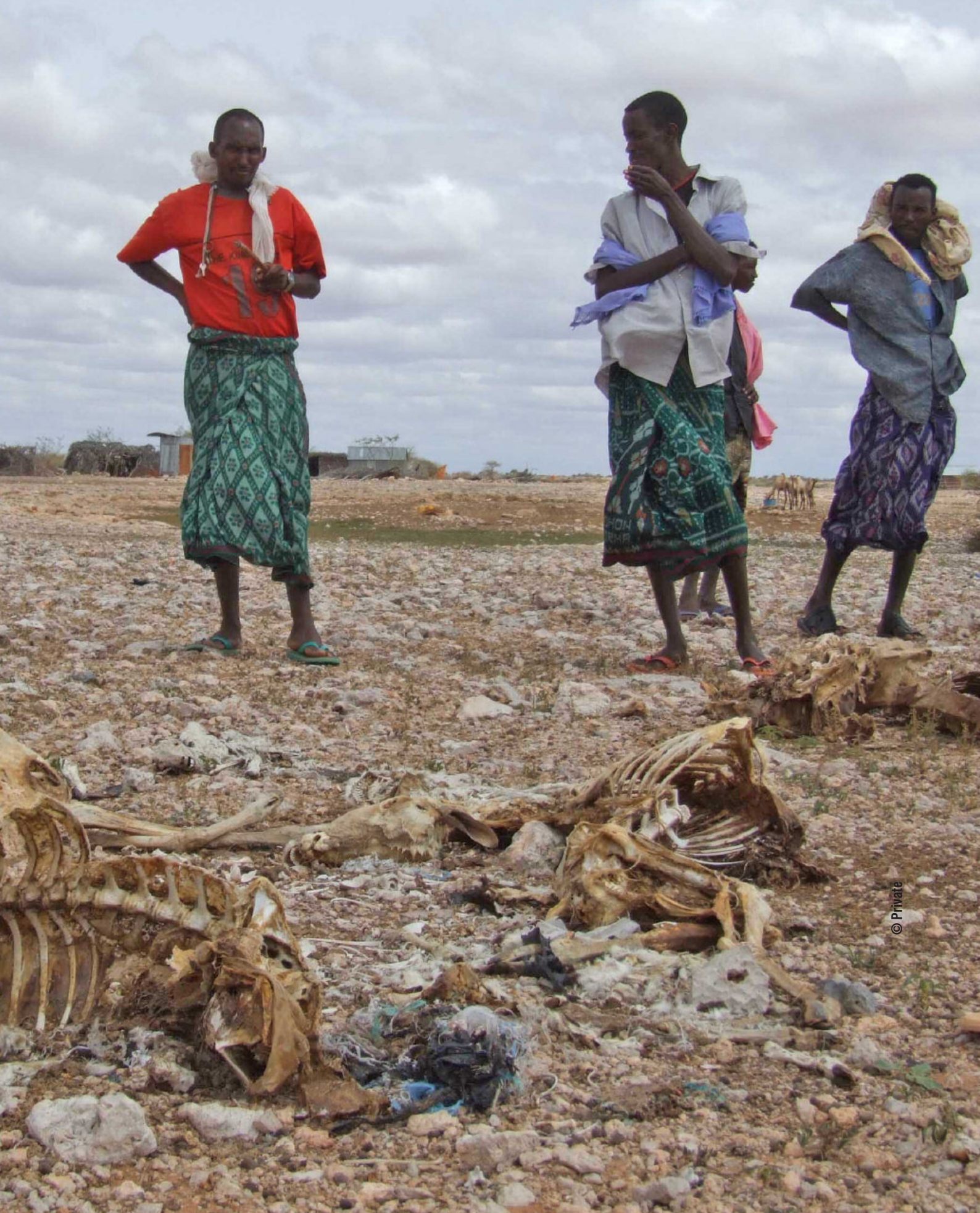
Men from the central region of Somalia who lost all their livestock during the 2008 drought.