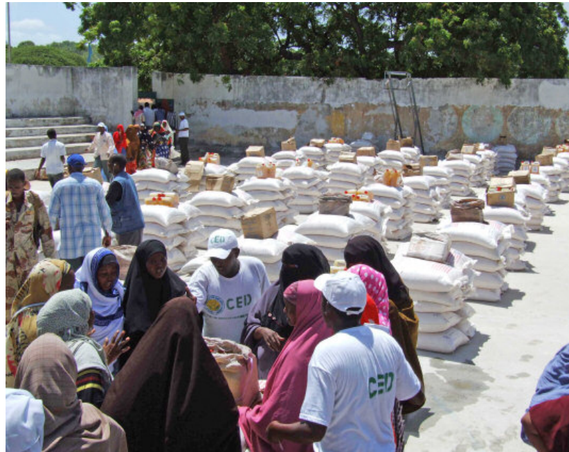
Distribution of food aid by a Somali humanitarian organization in Madina, Mogadishu, May 2007. Such aid is now under threat.

organizations, as the possibility that armed opposition groups are targeting their staff solely because of their work must be assessed, to ensure the safety of their staff and partner organizations. Currently many humanitarian organizations do not believe their staff are being targeted by armed opposition groups solely because of their delivery of emergency humanitarian aid or services; they have consequently assessed that they can continue delivering essential humanitarian aid and services in southern and central Somalia. However, the number of humanitarian staff killed