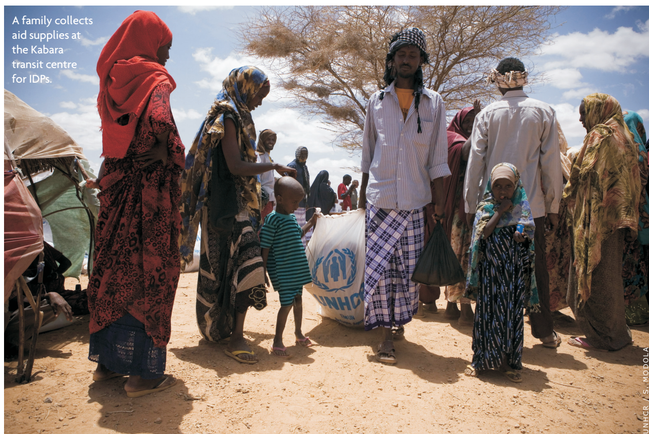
A family collects aid supplies at the Kabara transit centre for IDPs.