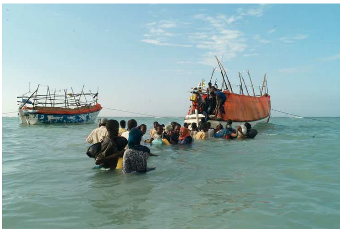
Figure 1: Migrants boarding boats near Bossaso

In early 2007, under the auspices of the Inter Agency Standing Committee’s (“IASC”) Protection Cluster, a Mixed Migration Task Force (“MMTF”) was established with UNHCR and IOM acting as co-chairs. MMTF membership includes OCHA, UNDP, UNICEF, OHCHR, DRC (Danish Refugee Council), and NRC (Norwegian Refugee Council). The purpose of the MMTF is to provide a more focused, rights-based strategy for response to protection and humanitarian needs of migrants and asylum seekers transiting through Somalia. It was recognized that while a degree of coordination and response existed, a pro-active, regional strategy that addressed the multi-faceted dynamics of this movement was lacking. All activities and outputs resulting from the work of the MMTF are overseen directly by the IASC Protection Cluster with regular consultations with the Somalia UN Country Team (UNCT).