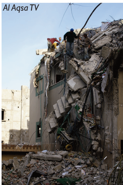
Al Aqsa TV