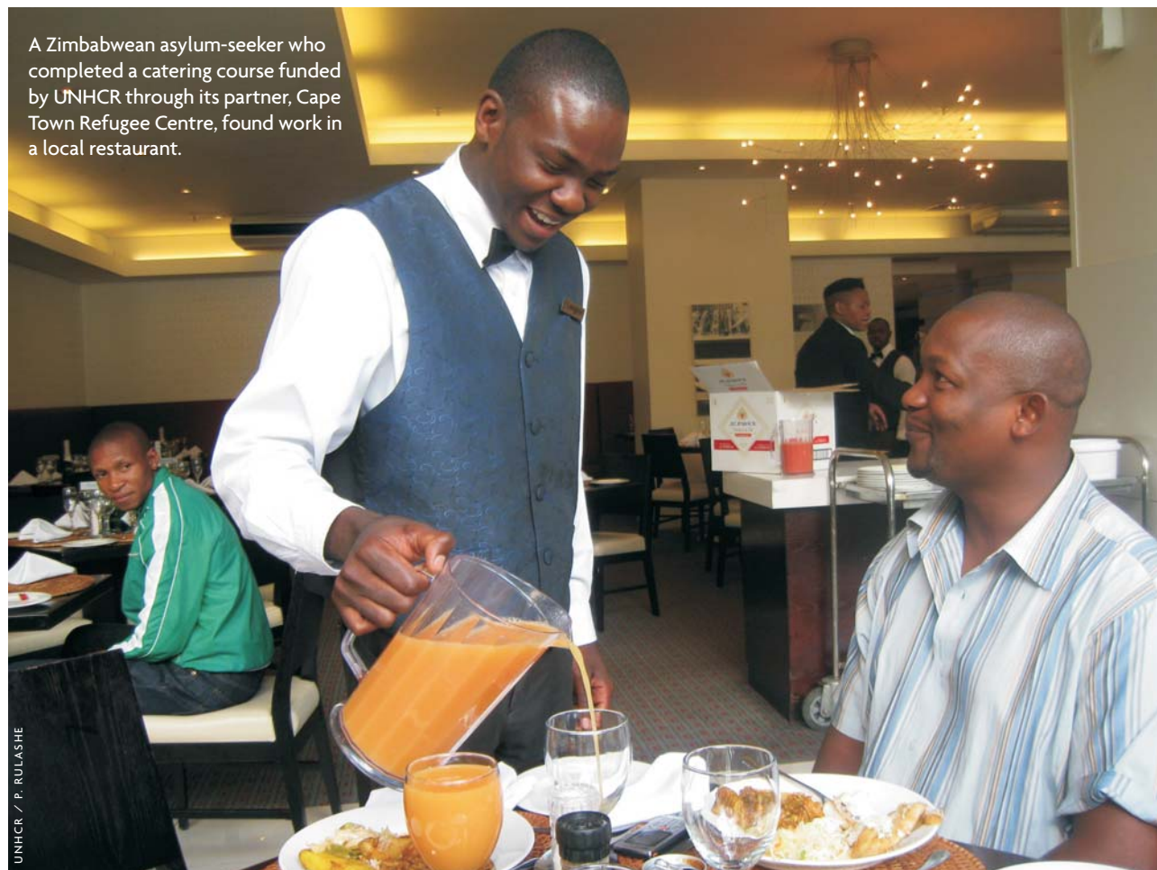
A Zimbabwean asylum-seeker who completed a catering course funded by UNHCR through its partner, Cape Town Refugee Centre, found work in a local restaurant.