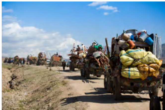
After a year in displacement, these IDPs are leaving New Durrani camp to return to their areas of origin in the central part of Kurram agency, FATA.

Military operations against non-state armed groups (NSAGs) have forced hundreds of thousands of people to flee North Waziristan and Khyber agencies since May 2014. Both agencies are part of the Federally Administered Tribal Areas (FATA) in the north-west of the country, a region that has suffered fighting and displacement for a number of years. By the end of 2014, up to 907,000 people had been newly displaced, and as of July 2015, there were an estimated 1.56 million internally displaced people (IDPs) in the north-west, including those who fled in previous years and after deducting returns.