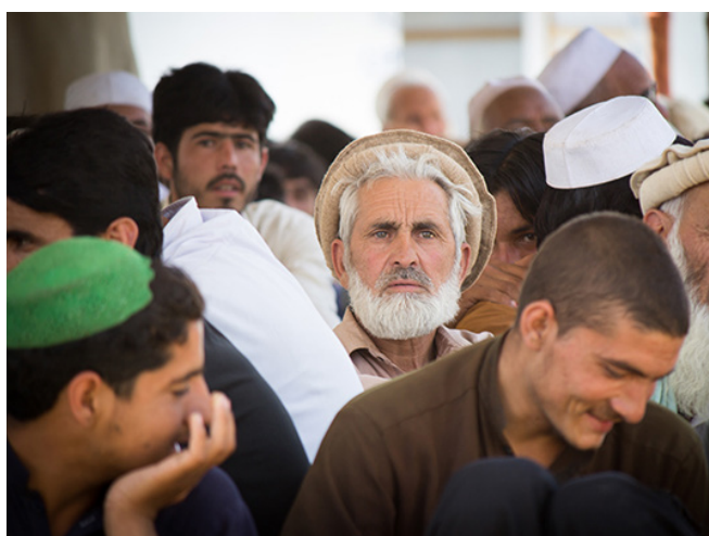
A displaced elder for Tirah valley is waiting in queue for the registration in Jirra, District Kohat, Pakistan. Photo: NRC Pakistan/Shahzad Ahmad, May 2013

Counter-terrorism and counter-insurgency operations and violent clashes between non-state armed groups continue to lead to major, rapid movements of internally displaced people (IDPs) in Pakistan's volatile north-west. Within the Federally Administered Tribal Areas (FATA), Khyber and Kurram agencies are currently the worst-affected areas. More than 415,000 people were newly displaced in 2012, and at least 131,000 more have fled their homes since mid-March this year ( OCHA , March 2013, p.2; OCHA , 6 June 2013). There are now 1.1 million IDPs registered as displaced by conflict in the north-west, and many more are unregistered in the region and elsewhere ( IDMC , 31 May 2011, p.1; UNHCR , 7 May 2013).