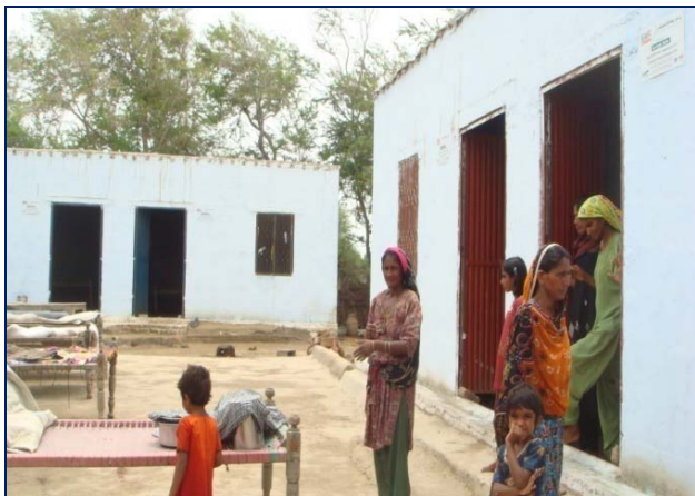
Semi- Packa Shelter