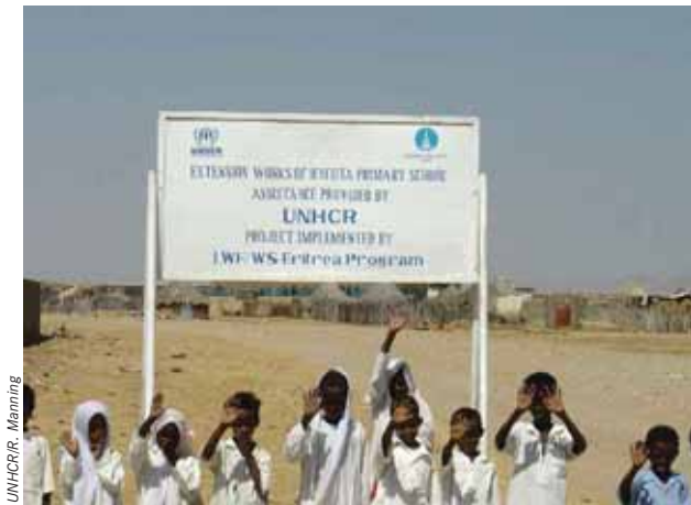
Haykota primary school, one of UNHCR's community reintegration projects.

malnutrition. The malnutrition rate for children under five decreased from 16 percent in June to 14 percent in December.