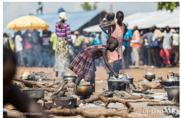
A young refugee girl who fled the fighting that began on 7 July 2016 in South Sudan, checks her pot of food at the newly established Pagarinya 2 camp in Adjumani District, northern Uganda.