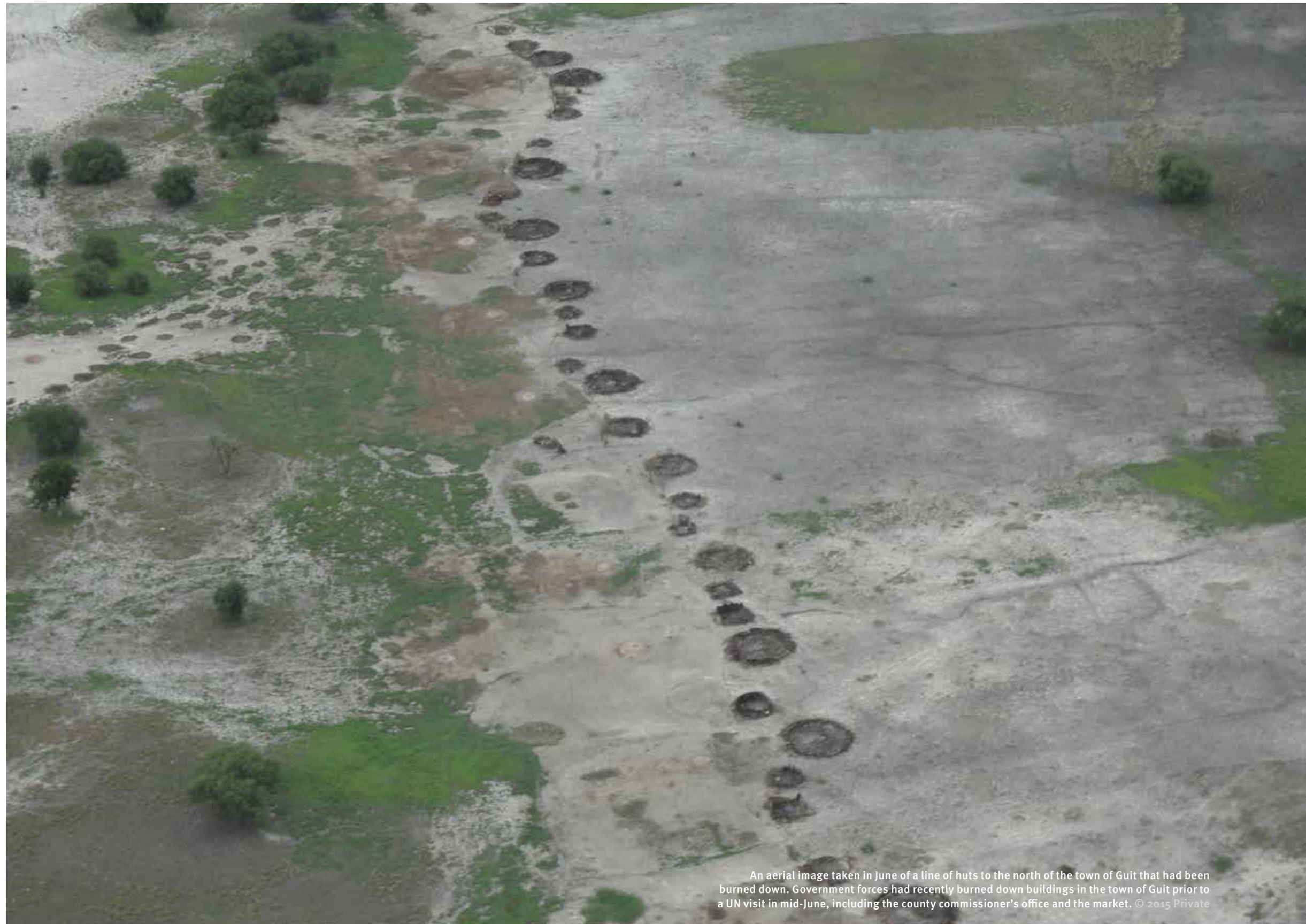
An aerial image taken in June of a line of huts to the north of the town of Guit that had been burned down. Government forces had recently burned down buildings in the town of Guit prior to a UN visit in mid-June, including the county commissioner’s office and the market.

However, the patterns of attacks documented by Human Rights Watch—the repeated burning of homes and