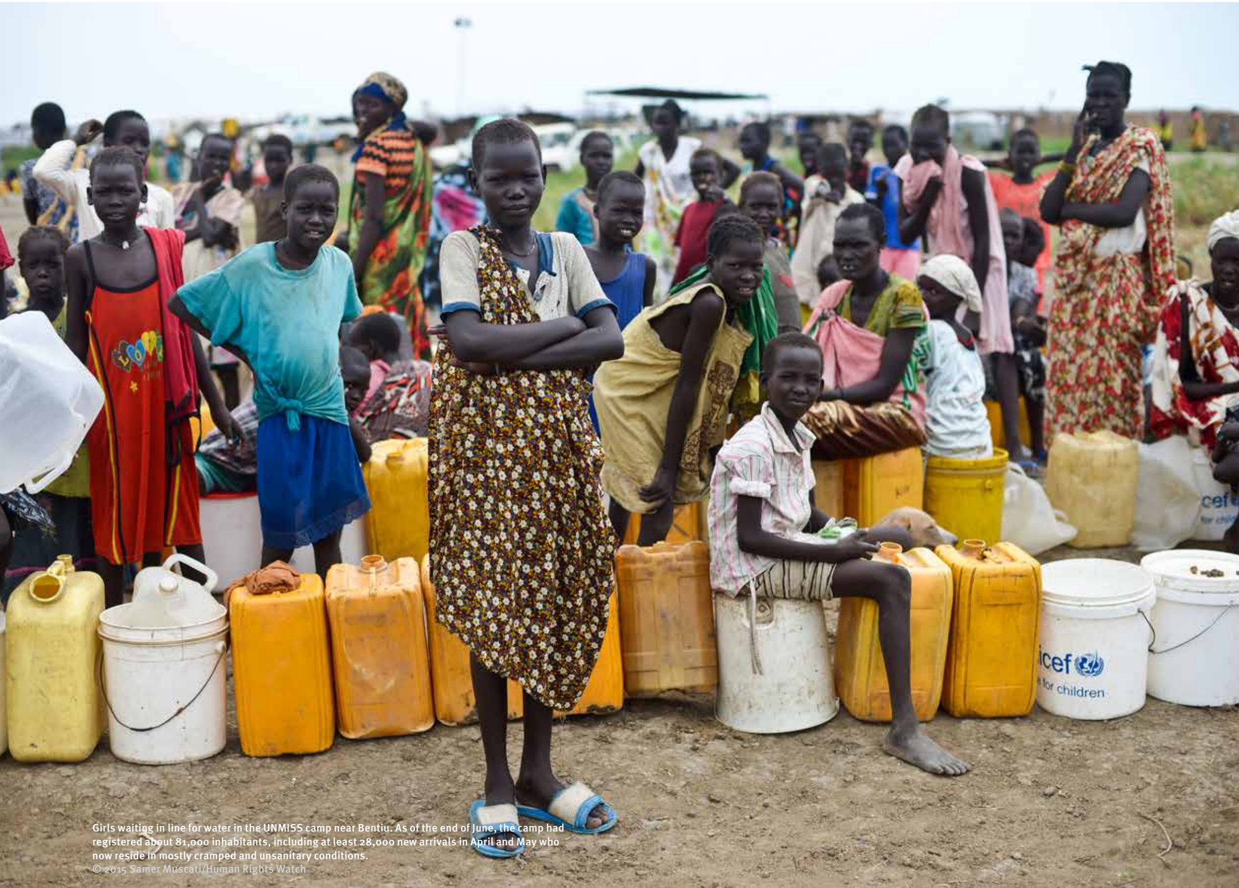
Girls waiting in line for water in the UNMISS camp near Bentiu. As of the end of June, the camp had registered about 81,000 inhabitants, including at least 28,000 new arrivals in April and May who now reside in mostly cramped and unsanitary conditions.