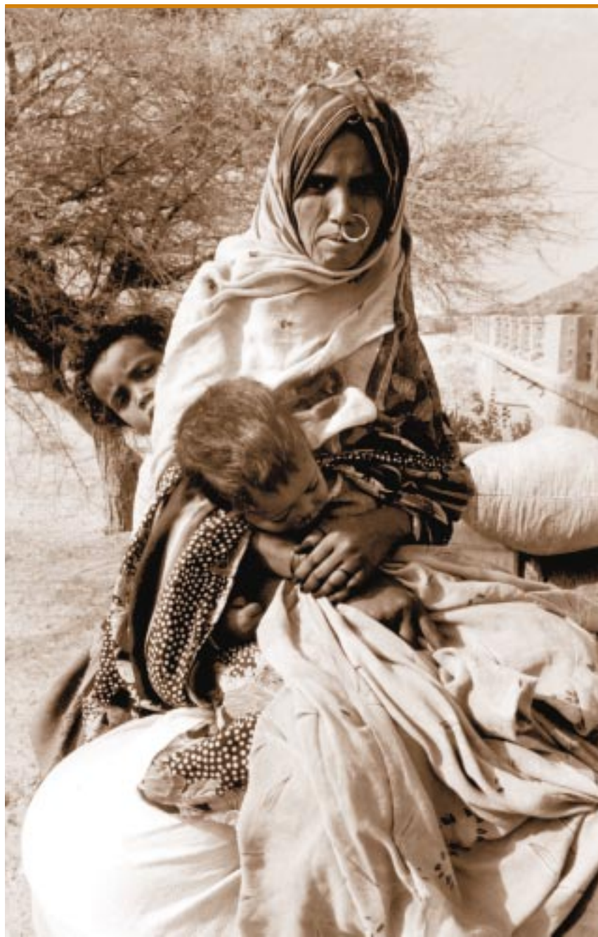
Women-headed households make up many of the refugee families returning to Eritrea today.

To pave the way for improved relations with the Sudanese government, Eritrean authorities closed all training and military bases in Eritrea used by Sudanese guerrillas and insisted that the guerrillas move their facilities inside northeastern Sudan. Although this did not entirely satisfy the Sudanese government, it permitted the Eritrea-Sudan border to re-open to commerce and trade.