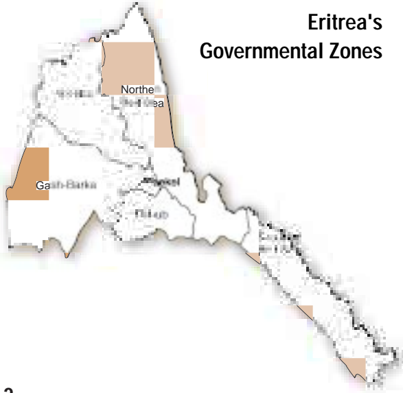
Eritrea's Governmental Zones