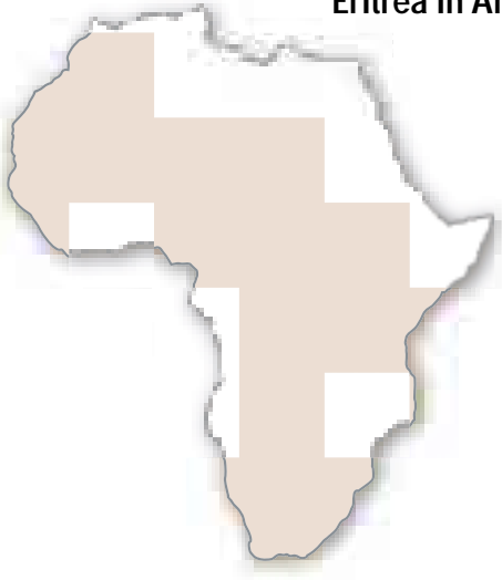
Eritrea in Africa