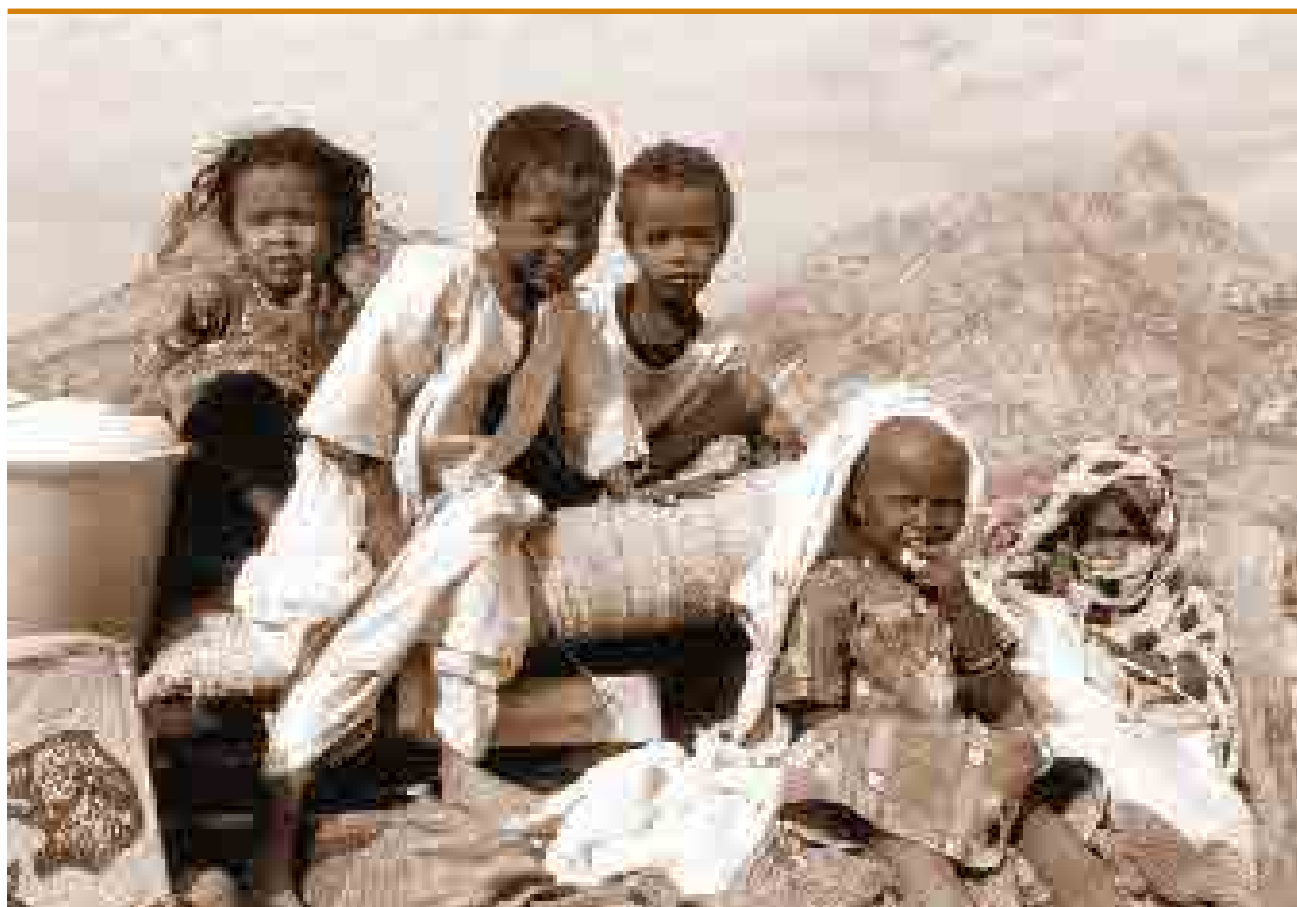
A war-displaced Eritrean family returns home to Gash-Barka from a refugee camp in Sudan with everything they own perched atop a rented cart.

The initial needs of internally displaced Eritreans uprooted for the past year are different from the needs of returning refugees who must start from scratch after decades of exile. Once the two populations are resettled into their homes, however, their long-term rehabilita-