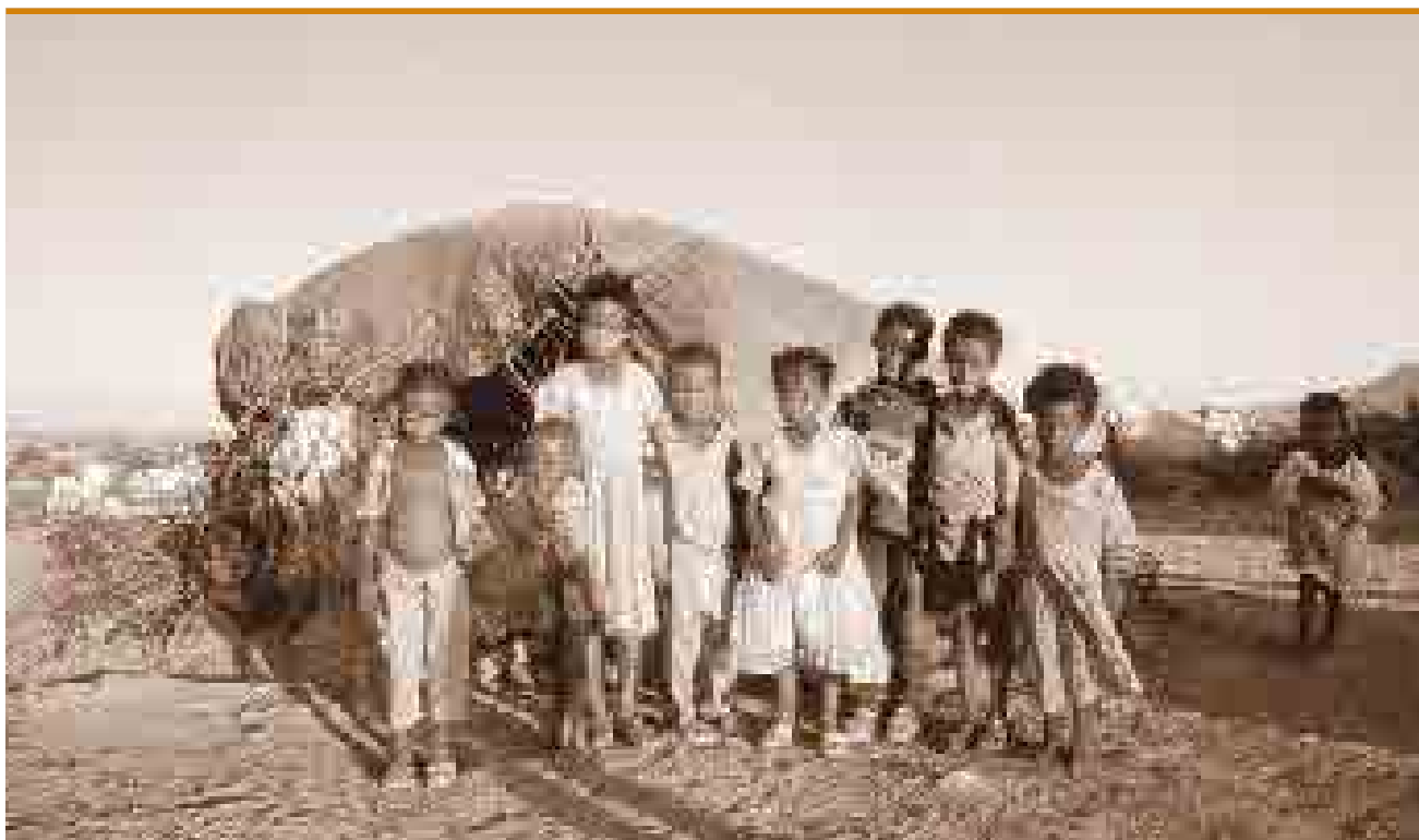
Refugee families returning from Sudan have to rebuild their lives and livelihoods from scratch

Those who choose to repatriate will undergo an orientation in Sudan involving presentations by Eritrean officials, UNHCR, and NGO representatives. Refugees