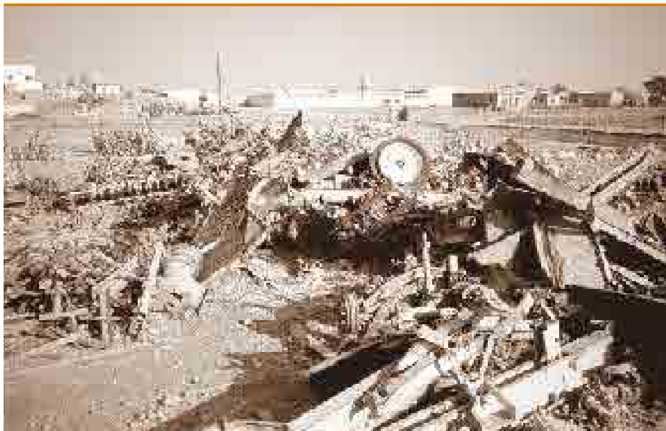
Ethiopian military forces destroyed farm equipment at the Ali Ghidir plantation in western Eritrea after occupying the town in May 2000.

USCR’s site visit found that reconstruction efforts were also progressing in villages and smaller settlements. Round, mud-brick houses with conical thatched-grass roofs are the norm there. Residents