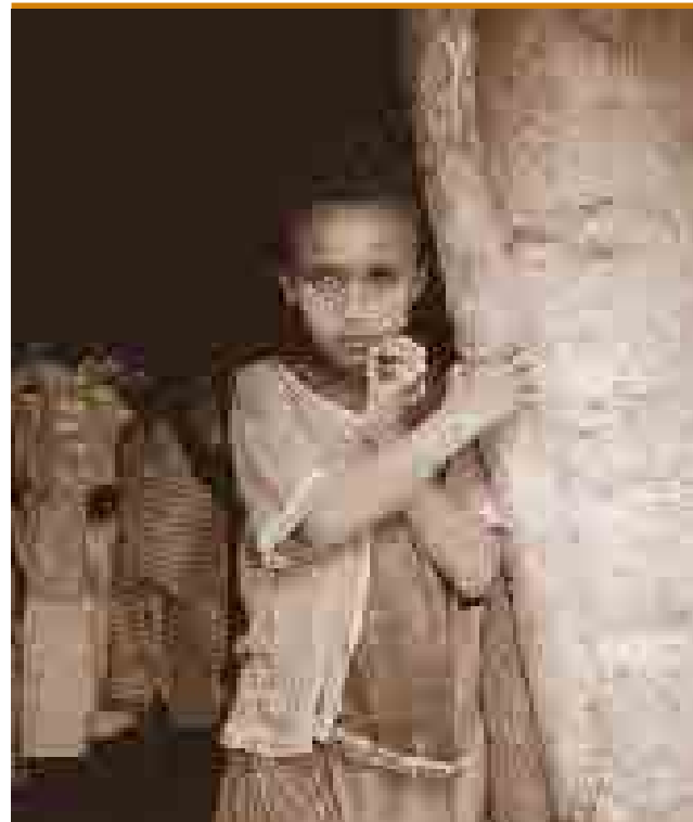
Many of those slated to return to Eritrea were born in Sudanese refugee camps and are seeing their homeland for the first time upon arrival in Gash-Barka.

All these factors argue for a properly funded program to facilitate voluntary repatriation now, without further delays.