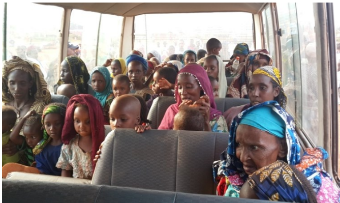
A convoy transporting women and children from the border entry point of Kentzou to Lolo site, East region, Cameroon.