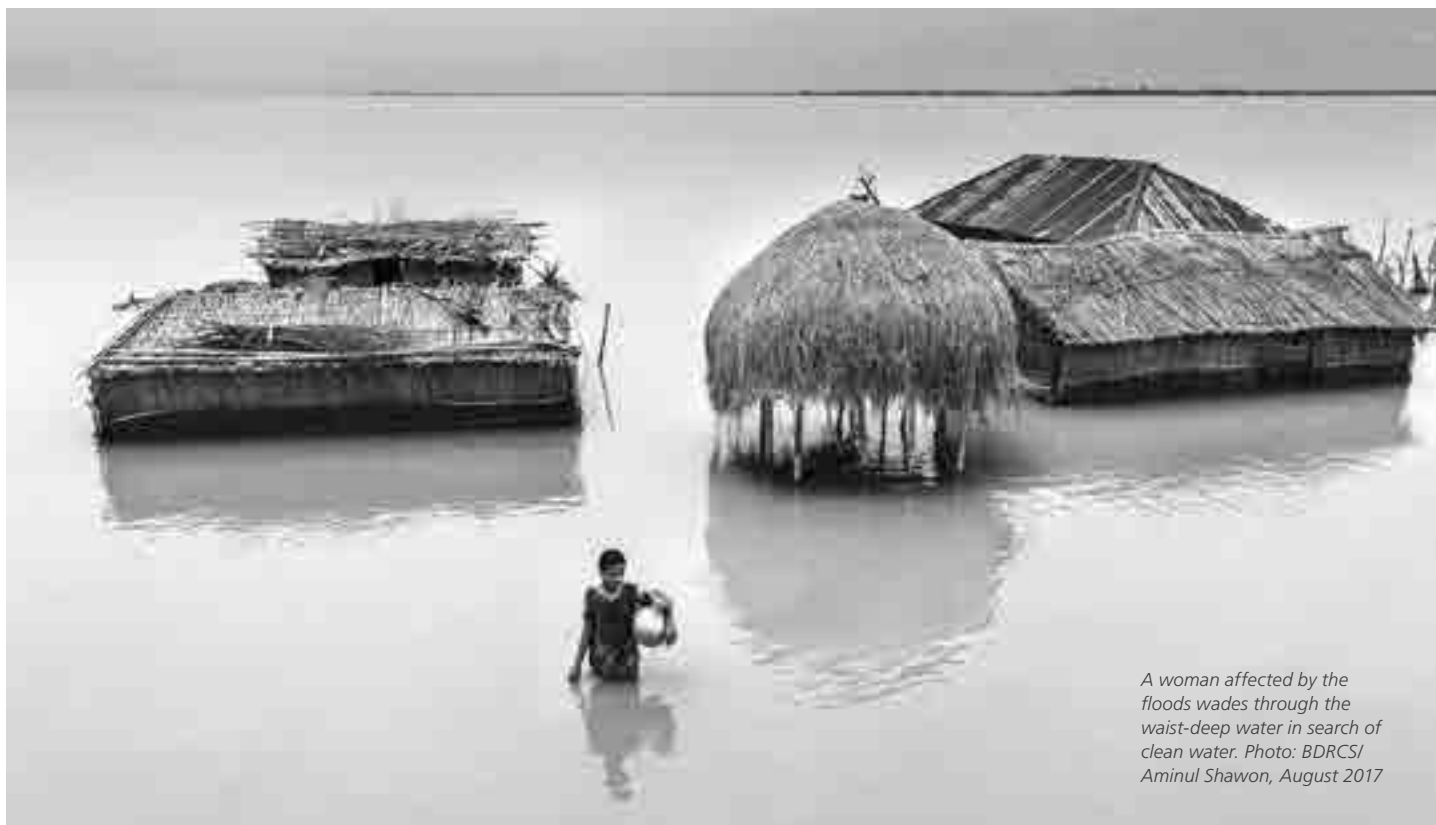
A woman affected by the floods wades through the waist-deep water in search of clean water. August 2017

Periodic violations of the ceasefire between India and Pakistan in the disputed territory of Jammu and Kashmir led to at least 70,000 new displacements in Indian-controlled areas and at least 53,000 in Pakistani-controlled areas.