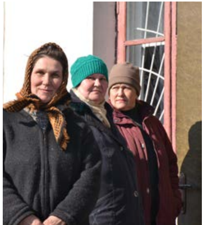
Internally displaced women in eastern Ukraine.

Despite the improvements in civil registration procedures outlined above, the system is still not comprehensive and continues to create obstacles for some IDPs. Unlike other Ukrainian citizens, who can apply for documentation at local registry offices, IDPs who cross the contact line from NGCAs