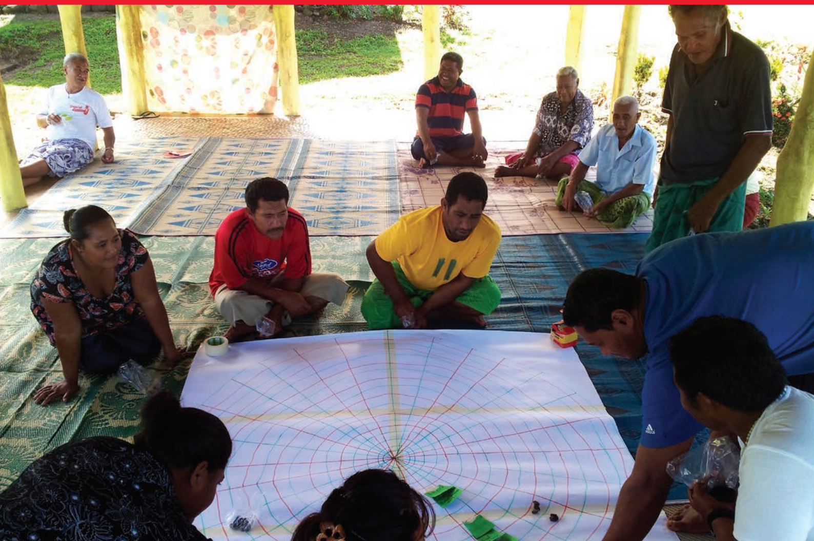
Wheel of livelihood resources in Poutasi village, Samoa.