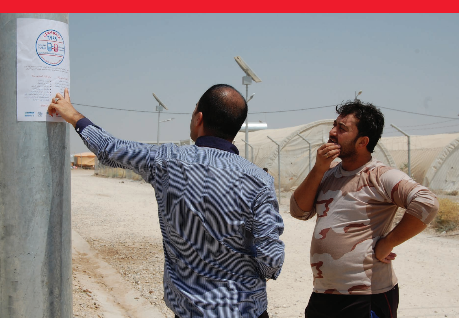
A WFP employee explains the IDP call centre

software, a ticketing system to allow callers to be identified if they called back or required follow-up and giving callers the choice of a male or female call handler were all built in.