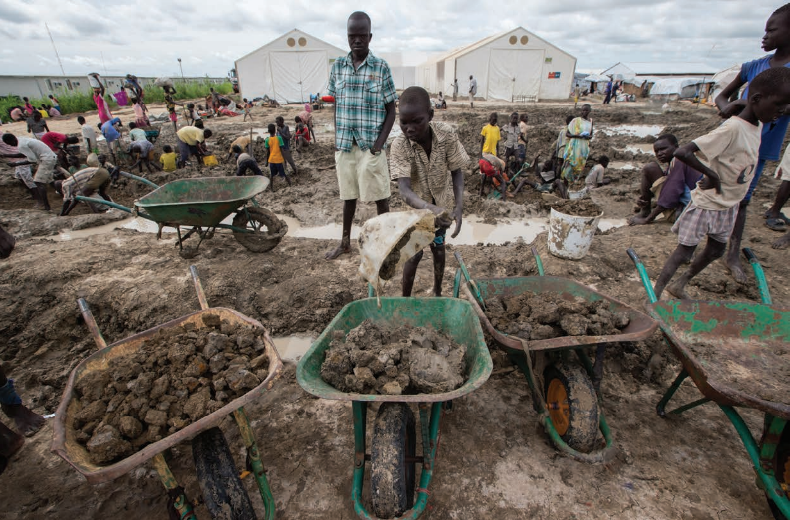
A boy fills wheelbarrows with dirt to build walls in the Protection of Civilians (POC) site near Bentiu, Unity State