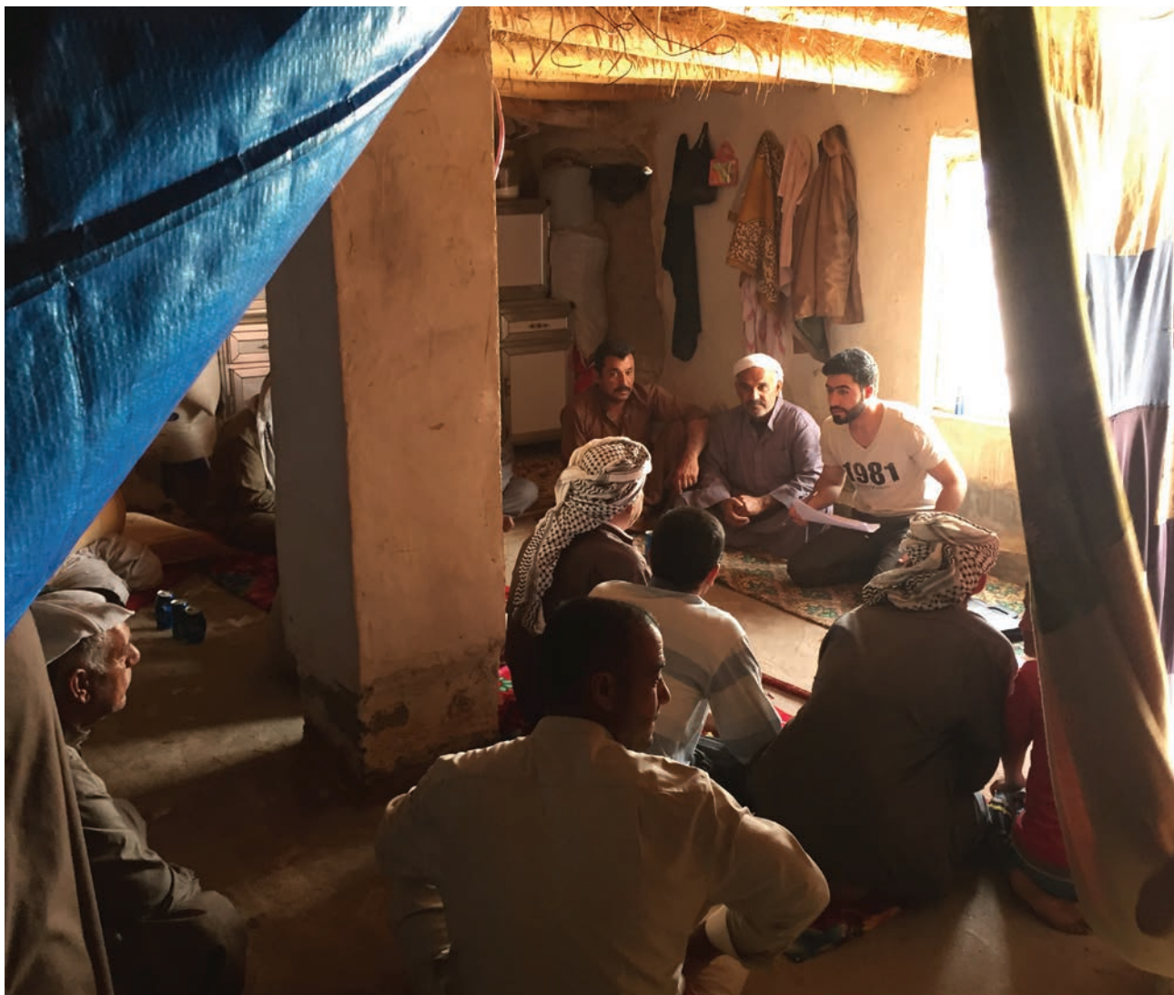
A data collector facilitates a focus group discussion with IDP men using the CLARA tool in Iraq

perceptions of security must be considered in developing durable solutions to their displacement. Host communities and IDPs reported a perceived uptick in petty crime, citing rumours of theft among shopkeepers. Fear of strangers focused on perceived affiliation with armed groups and risks to women and girls. As one woman noted, 'Most of the men do not go to work because they do not want the women to be alone in the village. We do not let our children go to work because there are strangers in the village'. Such fears have constrained freedom of movement, confining women and girls to the home and preventing traders from travelling far outside the village. People who have opted to remain displaced or who lack alternatives to return often have a bleaker view of security in their home village than those who have returned. These factors, as well as the absence of reliable statistics on crimes against civilians and communal conflict, make it difficult to analyse the security context in a way that, for example, effectively includes women's perspectives and participation and ensures 'do no harm' principles. 3