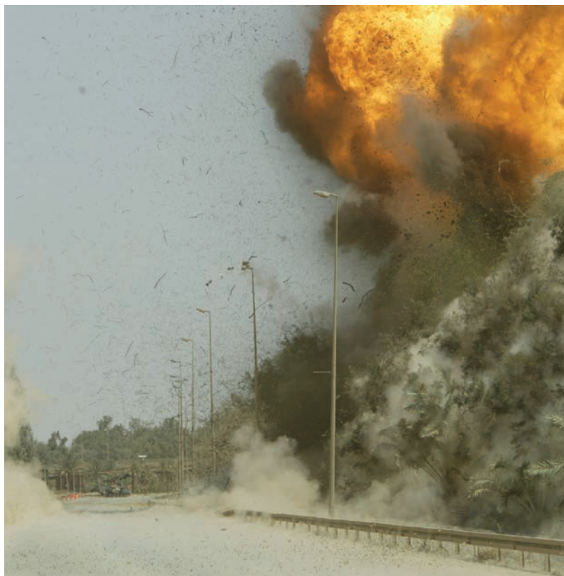
Controlled IED explosion in Iraq

The International Committee of the Red Cross (ICRC) has been able to implement protection programmes in accordance with its very specific mandate in IS-held areas. However, both NGO and UN representatives question whether any form of humanitarian acceptance will be achievable in territory under IS control. Some local organisations seem to have been able to gain intermittent access through their knowledge and contacts, but international aid agencies face specific challenges, including the direct targeting of foreigners and the risk of torture and death in the event of capture. The nature of these threats has made agencies reluctant to share information and analysis on their operations, security strategies or movements for fear that such information could fall into the hands of Islamic State and be used to target them.