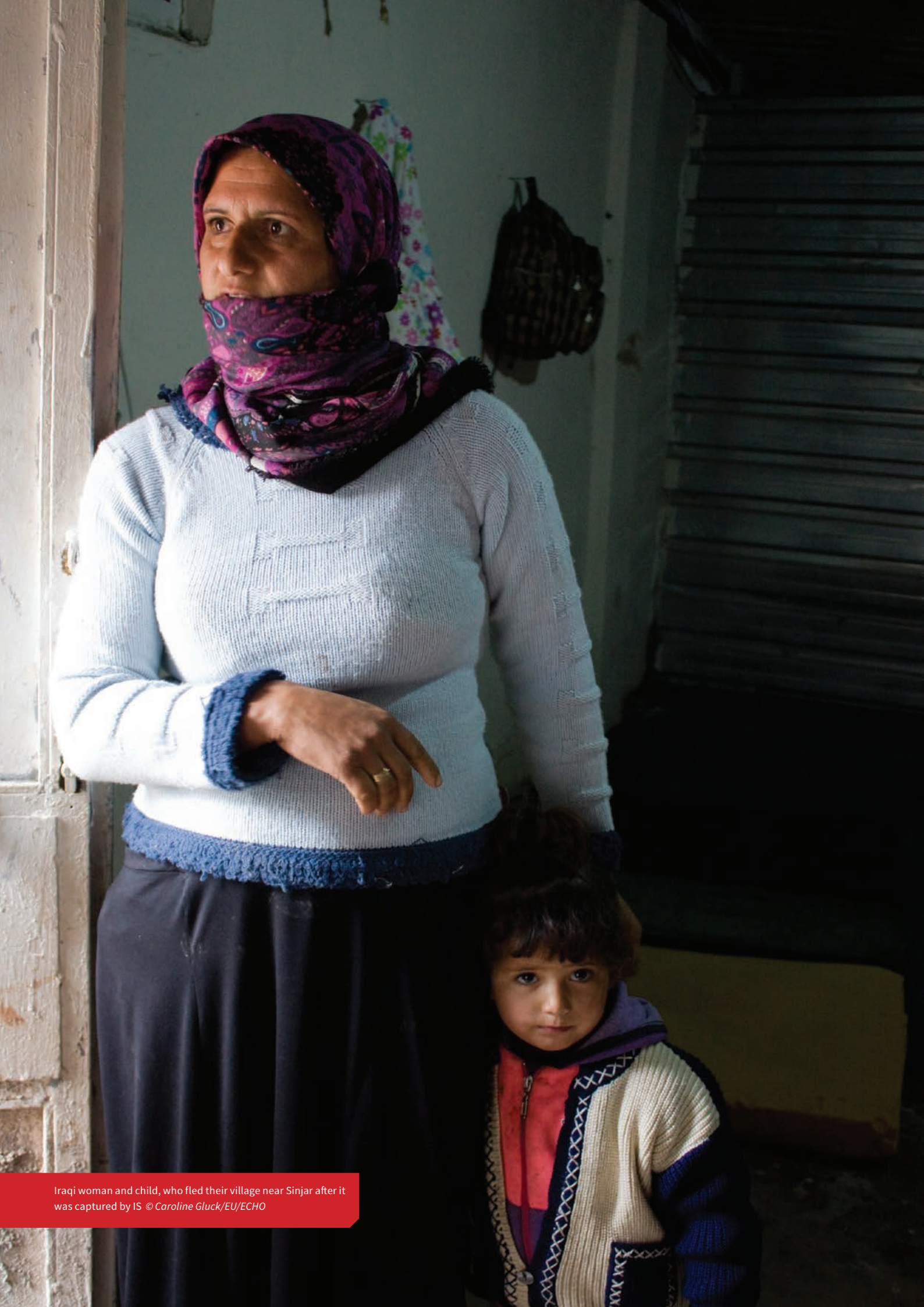
Iraqi woman and child, who fled their village near Sinjar after it was captured by IS