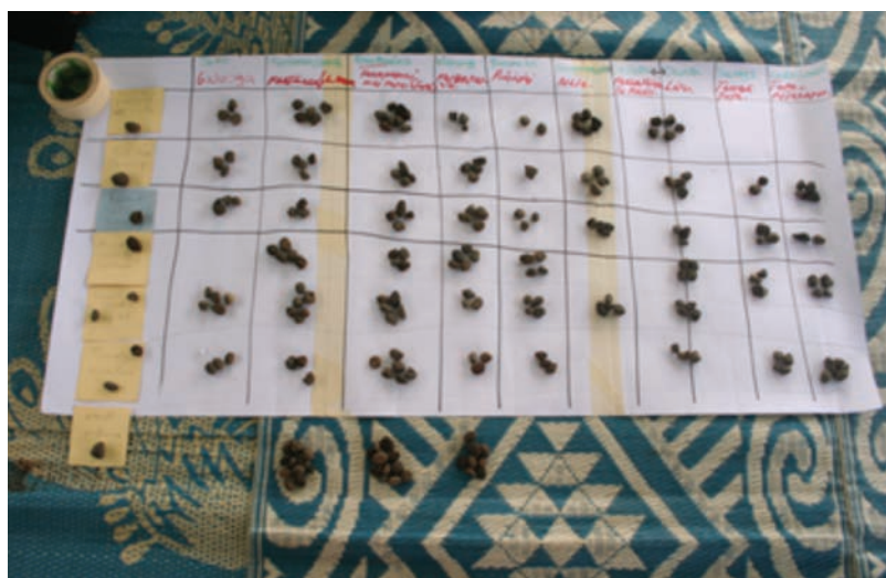
An example of matrix scoring

Bringing together people who are directly concerned with issues of remittances and disasters generated rich qualitative and quantitative information. The main strengths of participatory tools and methods were: