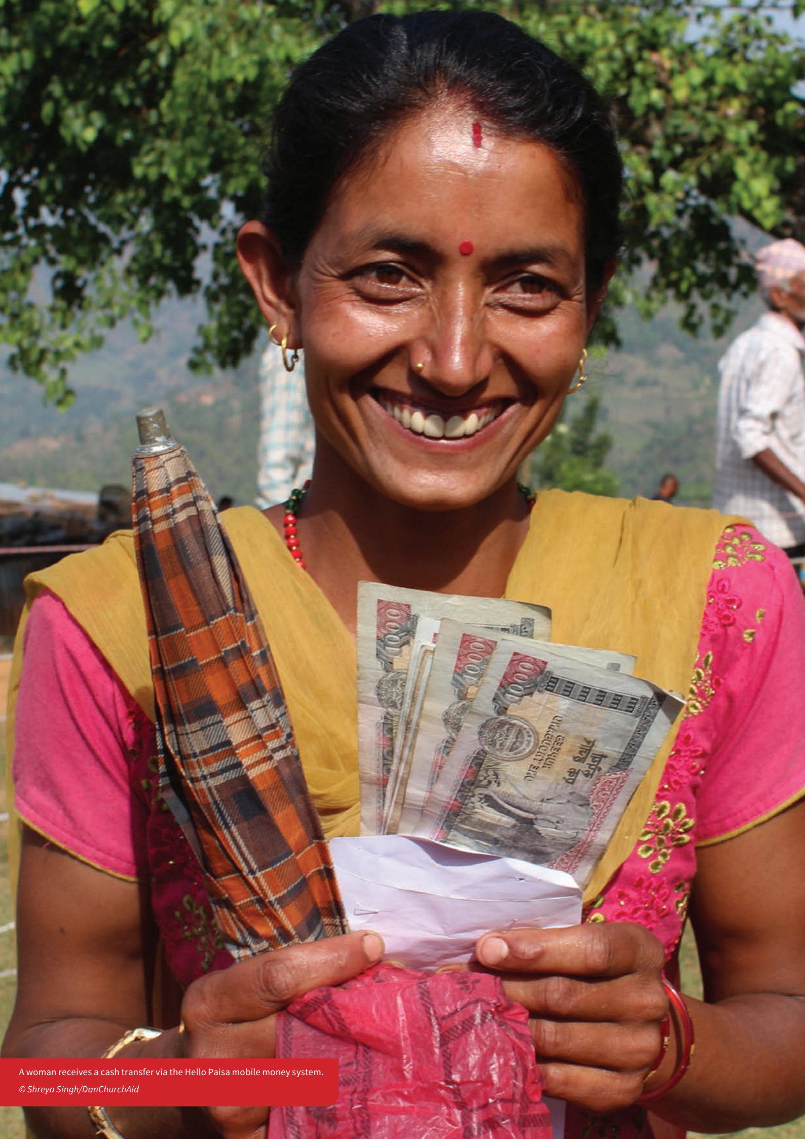
A woman receives a cash transfer via the Hello Paisa mobile money system.