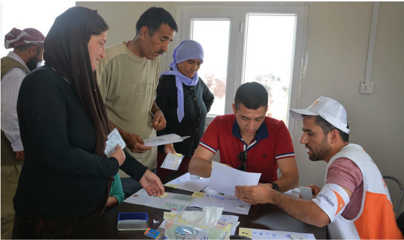
Registration of displaced people in Duhok, Kurdistan using LMMS

agencies accessing beneficiary data stored on a centralised server.