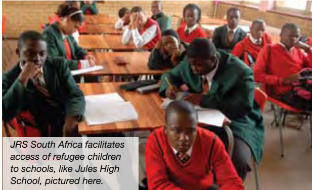
JRS South Africa facilitates access of refugee children to schools, like Jules High School, pictured here.