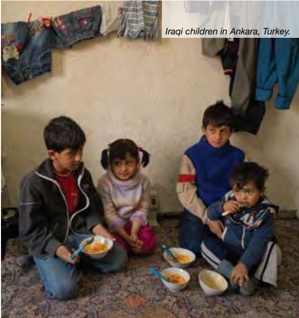
Iraqi children in Ankara, Turkey.