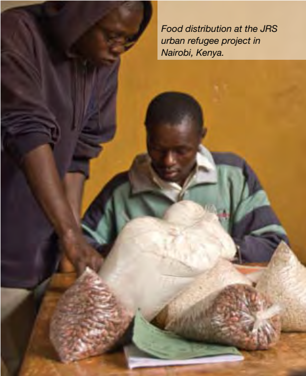
Food distribution at the JRS urban refugee project in Nairobi, Kenya.