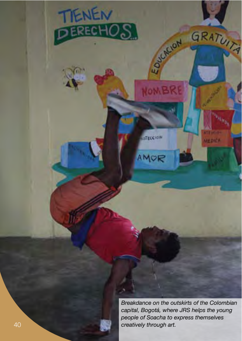
Breakdance on the outskirts of the Colombian capital, Bogotá, where JRS helps the young people of Soacha to express themselves creatively through art.