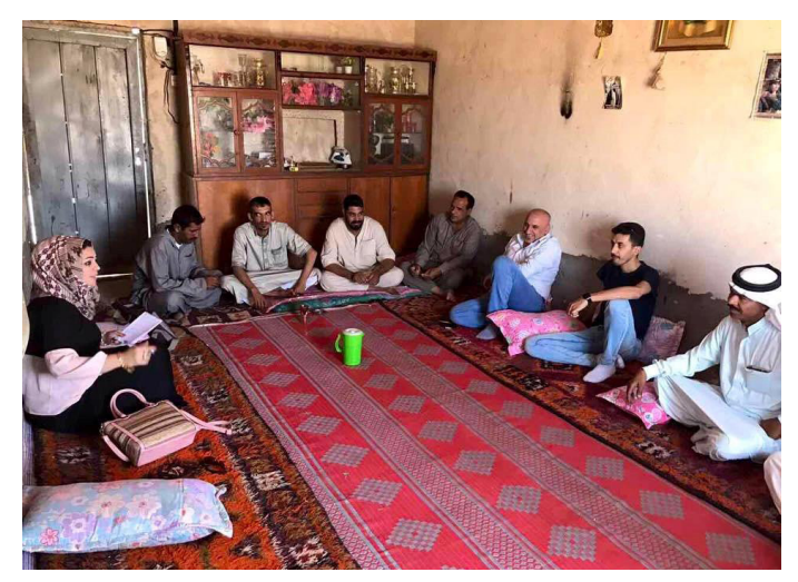
Mercy Hands lawyer providing counselling to a group of Bidoun in Basra governorate, in Iraq

With respect to Action 8 (Issue nationality documentation to those with entitlement to it), the NGO Mercy Hands completed in July a two-month survey in targeted governorates in Central and Southern Iraq to improve qualitative and quantitative data on stateless populations. During this exercise, Mercy Hands also provided legal assistance to 519 individuals and contributed to the issuance of 133 Nationality Certificates (Jinsiyeh), Civil IDs (Hawiyeh) and other legal documents.