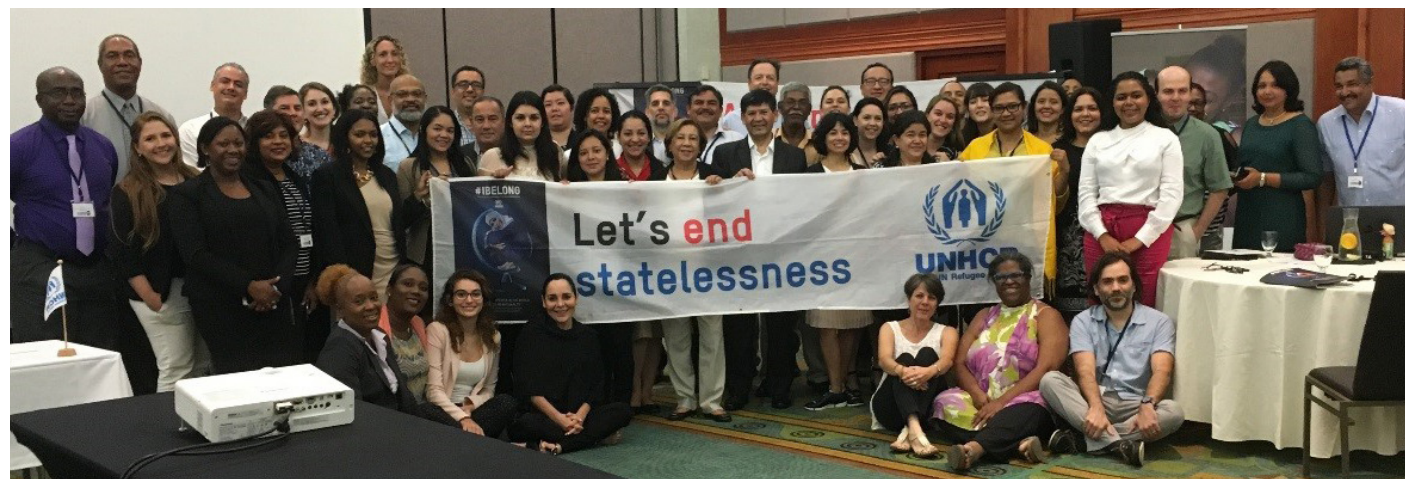
Sixth Regional Course on Statelessness in the Americas

On 21 July, the Ministry of Justice of the Kyrgyz Republic and UNHCR jointly organized a multi-stakeholder meeting to discuss measures to enhance birth registration and statelessness prevention in Kyrgyzstan. Participants included other Ministries, the Ombudsman's Office, civil society organizations and UNICEF. In order to help advance legislative reform, a working group under the Ministry of Justice was created. On 21 September, a similar event was organized by UNHCR and the Ministry of Justice of Tajikistan . The meeting was attended by representatives of several Ministries as well as UNDP and UNICEF. Next steps include close collaboration among the authorities, UNHCR and UNDP on the EPOS project concerning improvement of civil registration in the country and providing practical guidance on implementation of the Law on Civil Registration.