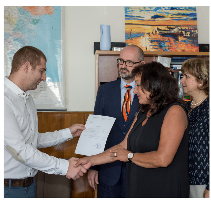
First person to be granted stateless status by the Bulgarian Government since the adoption of the statelessness determination procedure

On 22 August, the President of Chile , and the Ministers of International Relations, Interior and Public Security, signed a bill on the new Migration Law . The bill, which has been introduced to Congress, includes guarantees such as temporary residence permits for stateless persons and appoints the Ministry of Interior and Public Security as the competent authority for conducting statelessness determinations.