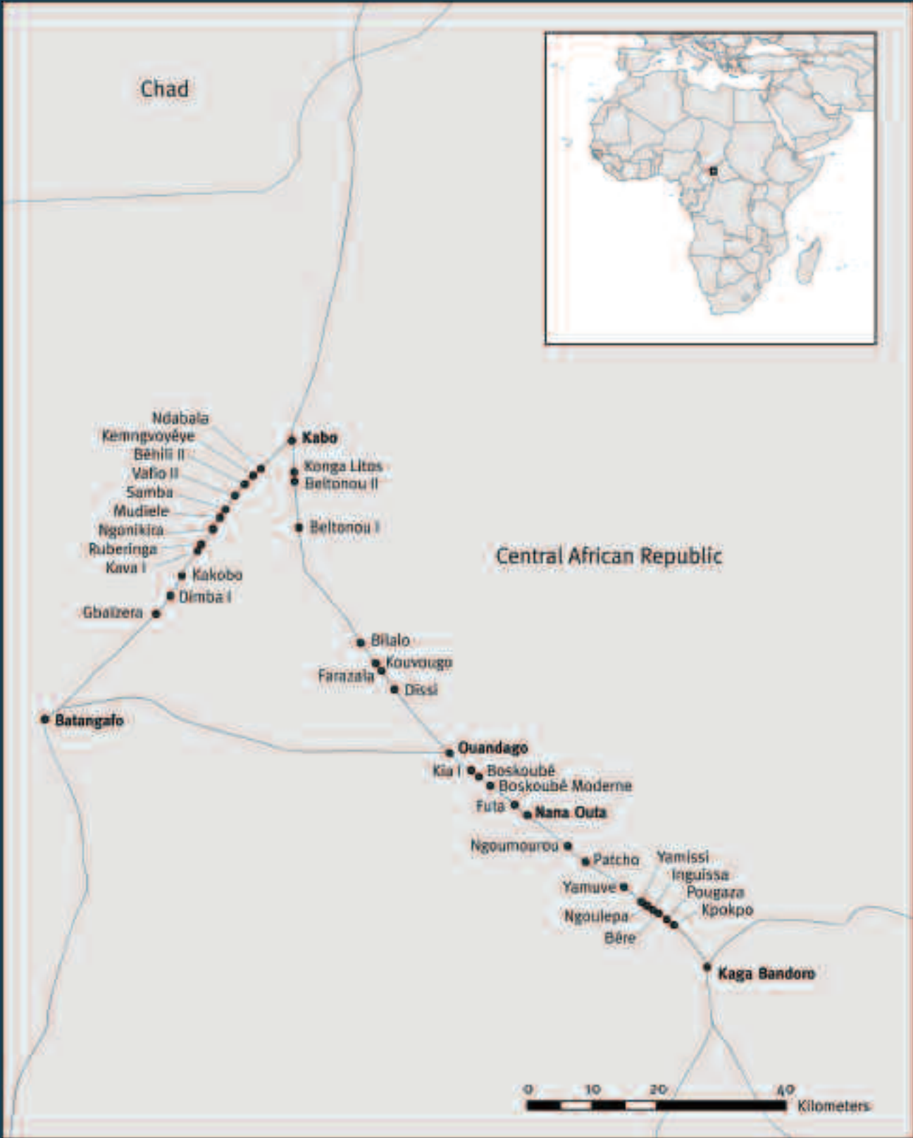
Villages affected by house burnings in the Batangafo-Kabo-Ouandago-Kaga Bandoro area in 2006-2007