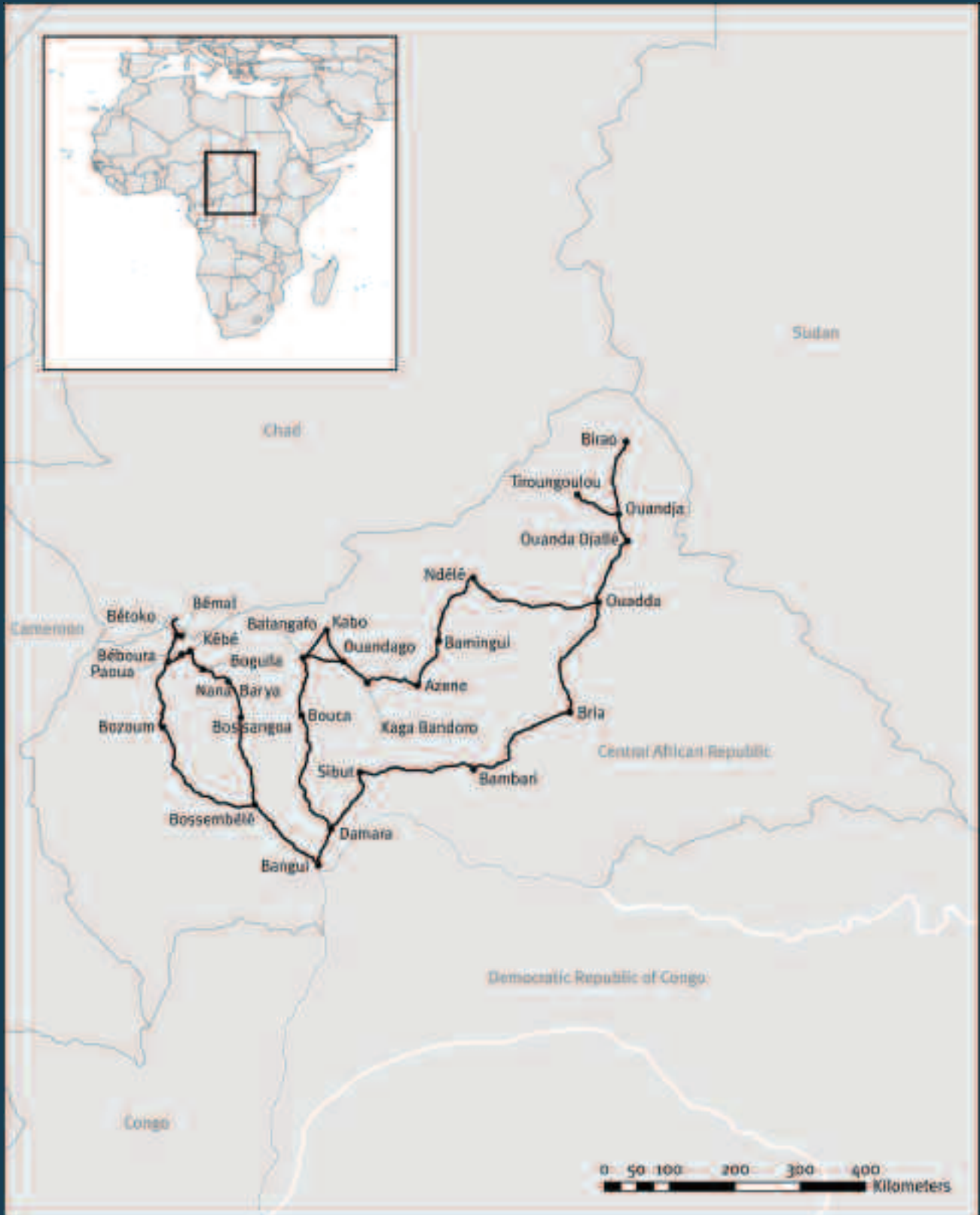
Route of February-March 2007 Human Rights Watch research mission