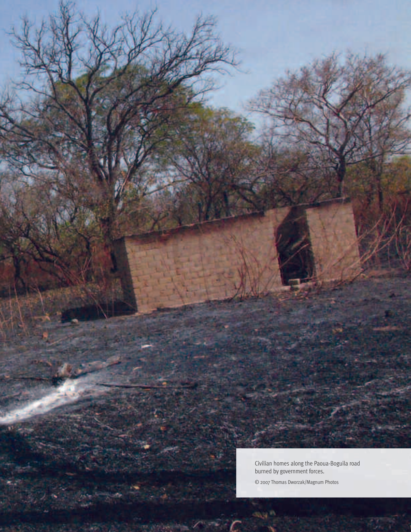
Civilian homes along the Paoua-Boguila road burned by government forces.