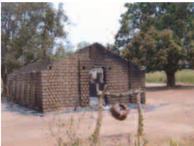
A church burned by government forces near Kabo.