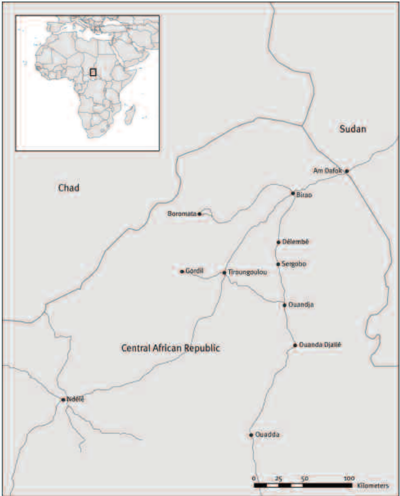
Area of UFDR rebel activity in northeastern Central African Republic in 2006-2007