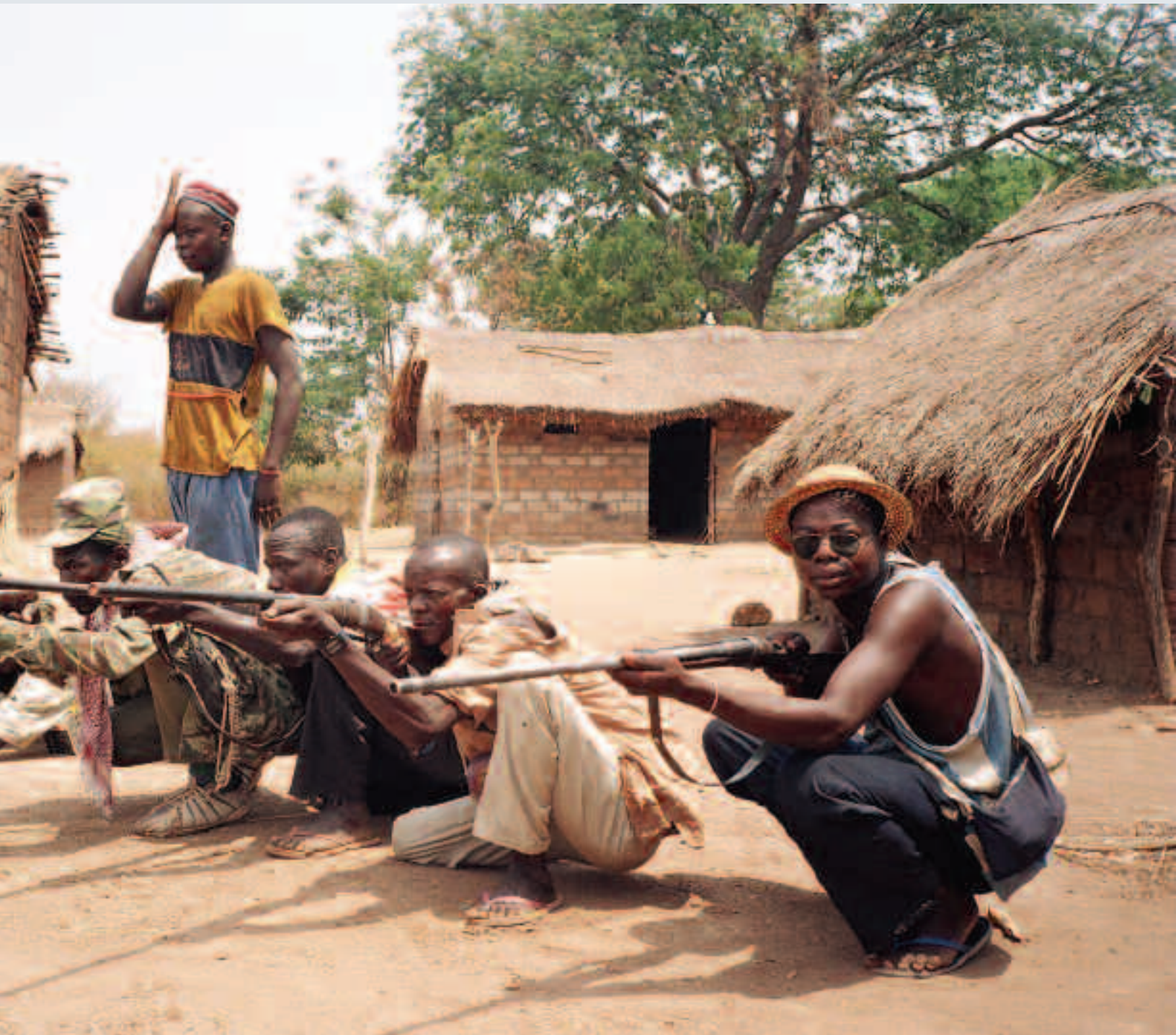
A group of APRD rebels near Ouandago pose with their homemade weapons.