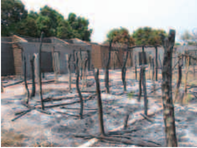
The destroyed market of Kouvousou village, where Presidential Guard troops burned some 220 homes and shops in December 2006.