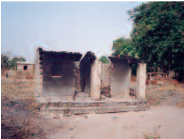
One of many homes burned in Ouadda in December 2006 in retaliation for the perceived support of the Gula community for the UFDR rebellion.