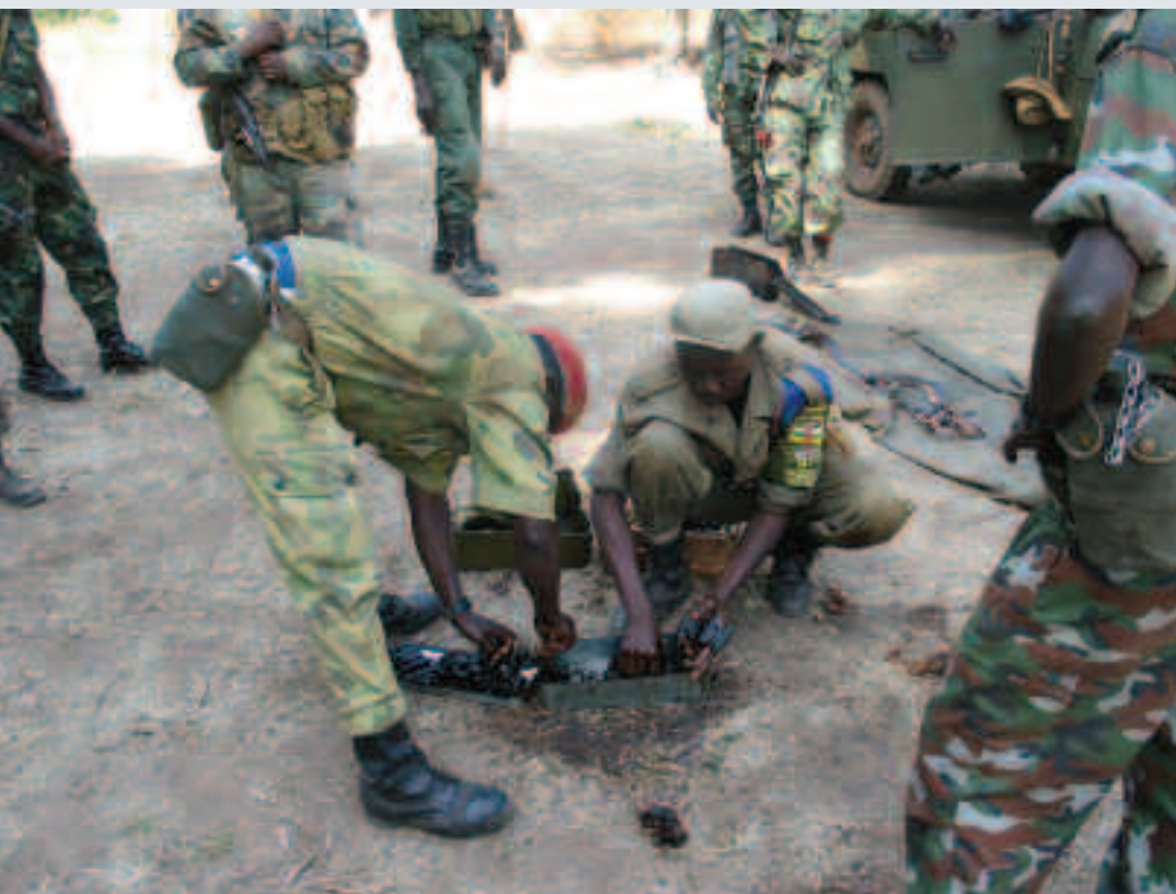
FACA soldiers prepare to patrol in APRD-controlled areas between Batangafo and Kabo.